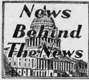
(Continued from Page One.)