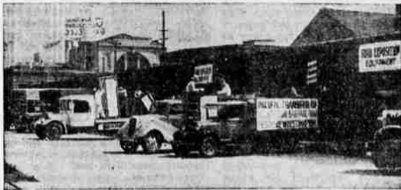
Fleet of trucks rushes opening of first 500,000 pounds of equipment for the Ford Exposition which opens in San Diego May 29. Thirty-six cars, carrying 1,800,000 pounds of apparatus and exhibits, will feature the Ford Exposition.