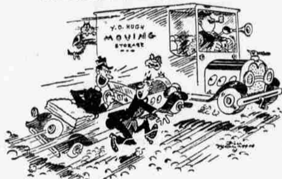
Why don'tcha look where you're going!