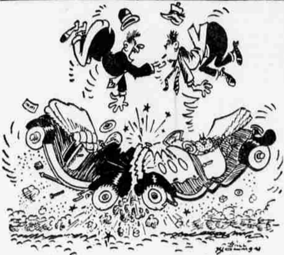
Idiot!—I had the right of way and you know it!