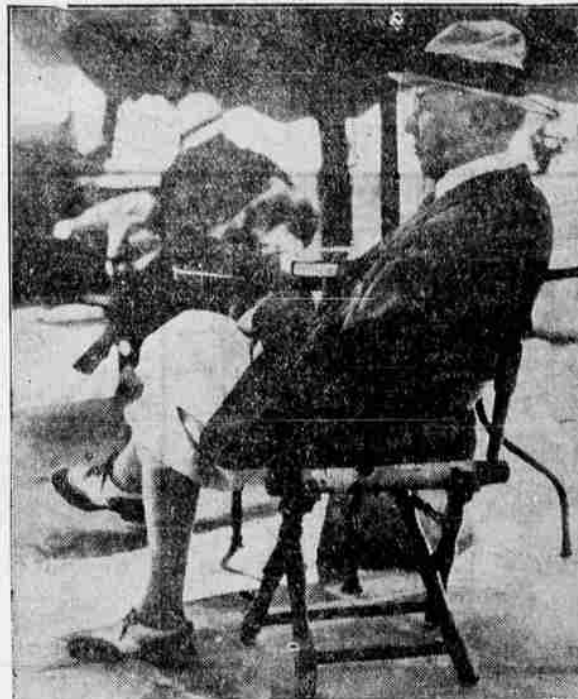
Stricken suddenly at his estate near Jacksonville, Fla., Alfred I. DuPont (above) organizer and former head of the DuPont de Nemours and Co., huge Delaware munitions concern, died at the age of 72.