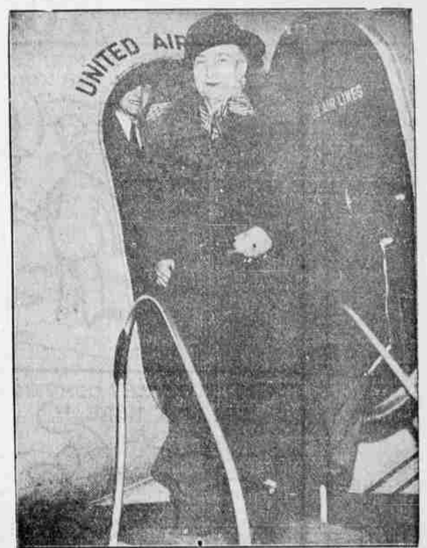
Mme. Ernestine Schumann-Heink, well known concert singer, is shown as she boarded a plane in Chicago, Ill., for Newark, N. J. It was the singer's first airplane ride.