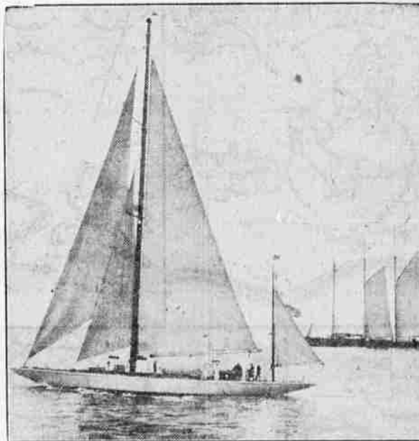
The sloop Yankee (above), with the Atlantic as an escort, started for England from Boston to meet Europe's fastest racing boats in 40 odd sailing contests this summer. There was a crew of 25 aboard the America's Cup contender of last year.