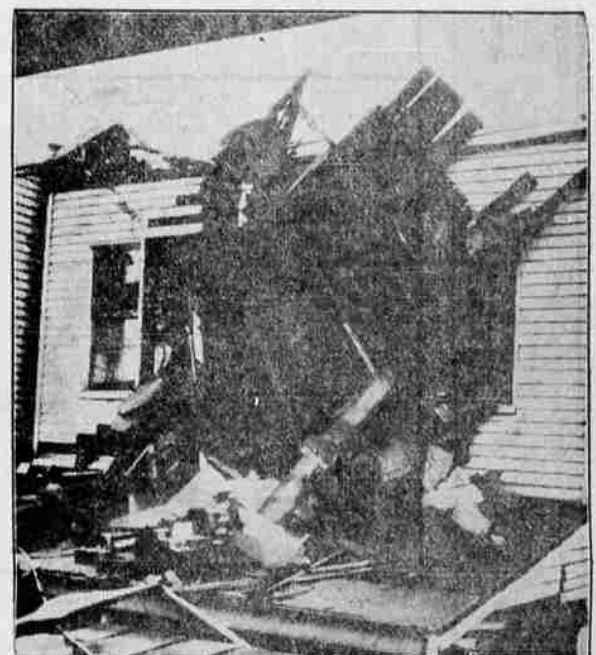
Part of the damage done to the house in which three persons were killed when a windstorm struck Louisville, Ky. More than 100 homes and 50 business buildings were damaged.