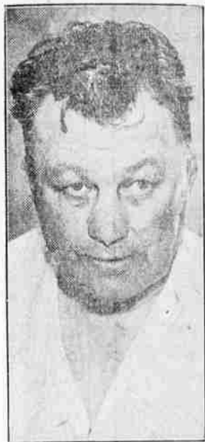
Firer Jim Flynn, 55, died in a receiving hospital in Los Angeles where he was taken suffering from a heart attack. The old time heavy-weight who once knocked out Jack Dempsey died 10 minutes after posing for this picture.