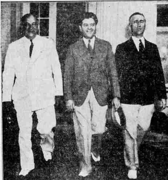
Three congressional leaders leaving the White House after conferring with the President on NRA plans. It was agreed, according to report, to push labor and social security legislation but not to rush new NRA laws. Left to right: Senators Wagner, LaFollete and Byrnes.