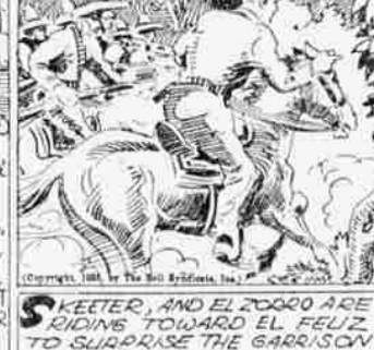
OF THE TRAITOROUS GOMEZ-