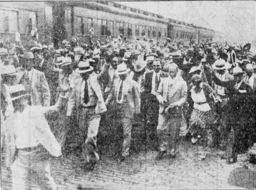
A general view at the union station yards in Washington, D. C., as thousands of farmers arrived in special trains to attend the AAA demonstrations planned to show faith in the administration program. These farmers came from Kansas and Louisiana.