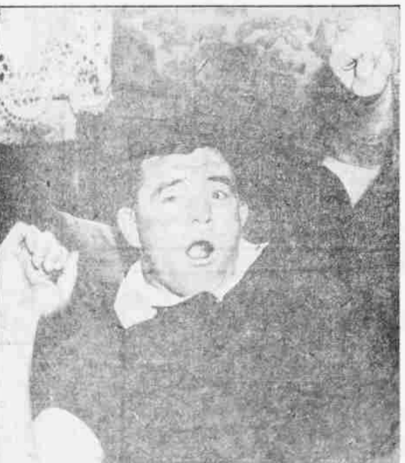
Jimmy Braddock is taking plenty of rest at Lock Sheldrake, N. Y., as he gets ready for intensive training for his fight with Max Baer in New York June 13 for the heavyweight title.