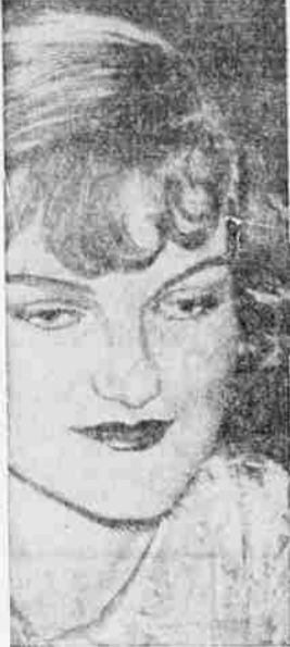
Despite frequent letters to him expressing an interest in his philosophy, Doris Duke Cromwell (left), frequently called the "richest girl in the world," was denied an audience with Mahatma Gandhi (right). The tobacco heiress is honeymooning in India with her husband.