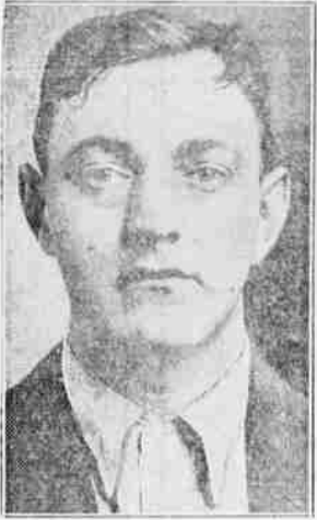
While agents of the federal government pushed an extensive search for him, Dutch Schultz (above), New York beer racket leader, and for many months a fugitive, surrendered for trial on an income tax evasion charge. Schultz's right name is Arthur Fliegenheimer.