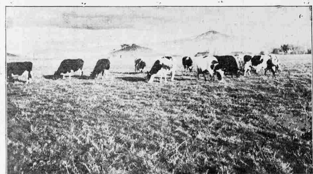
That the winter bluishgrass or poa bulbosa, grown here extensively since its chance discovery several years ago, may serve as anchorage for the winnowed soil of the mid-west was indicated today by receipt of an order from the government for 50,000 pounds of seed. The winter above shows cattle grazing on a Rogue River valley field of the succulent grass. Poa bulbosa lies dormant in summer and grows in the winter months.