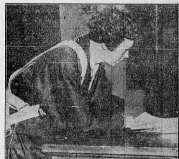
Here's Amelia Earhart, premier aviatrix of the United States, glancing over the map of Mexico in a Los Angeles airport just before she took off in her attempt to make a non-stop trip in her trim airplane from Los Angeles to Mexico City.