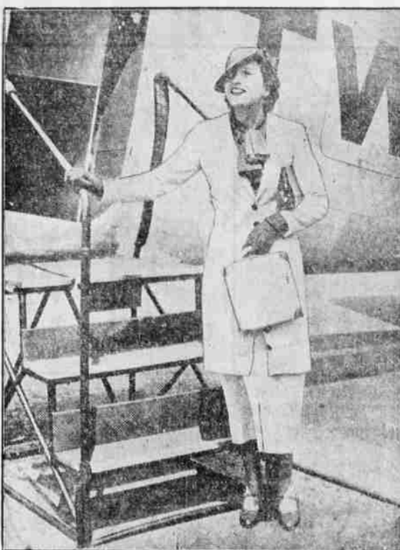
Kay Francis' idea of an Easter parade was to board an airplane in Hollywood and flit across the continent to New York City, from where she planned to leave for Europe. She was outfitted in a pearl gray suit with hat to match for her flight.