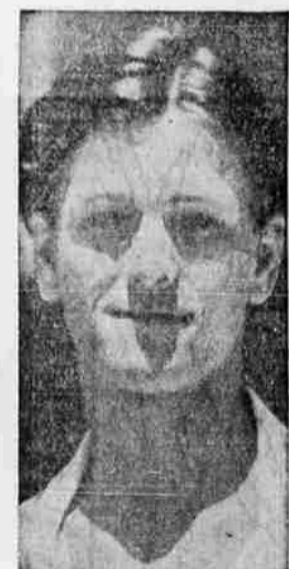
While she was startlin, the sports world several years ago with her prowess in track, basketball, baseball and other sports, Mildred "Babe" Didrikson (above) insisted "Babe" was her real love. Now the Texas wonder-girl is definitely on the trail of the national women's golf title, having won the Texas championship.