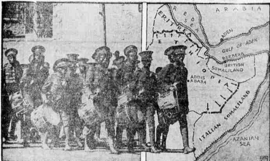
Ethiopia was moving troops up to her frontiers, according to dispatches from Addis Ababa, to meet what her government regarded as a threat from Italy's East African forces. Above is a photo of native Ethiopian troops on the march and at right is a map showing the Italian Somaliland borders where detachments have been stationed.