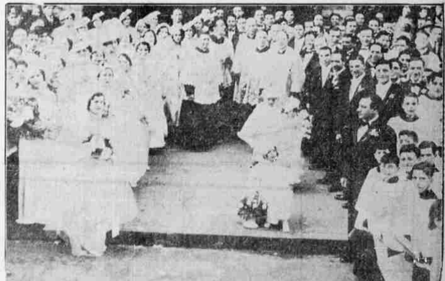
Because Lent forced a delay in their matrimonial plans, 28 Italian-American couples participated in a wholesale wedding in New York City. They were married at 15-minute intervals. Here are some of the newlyweds leaving the Bronx church where the ceremonies took place.