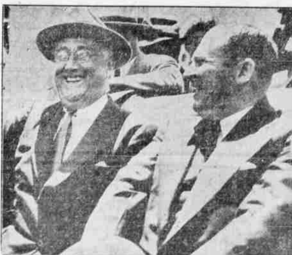
President Roosevelt appeared happy when he returned to Jacksonville, Fla., from a 12-day fishing trip off the Florida coast. Here he is with Gov. Dave Sholtz of Florida after he landed from the U. S. Farraut.