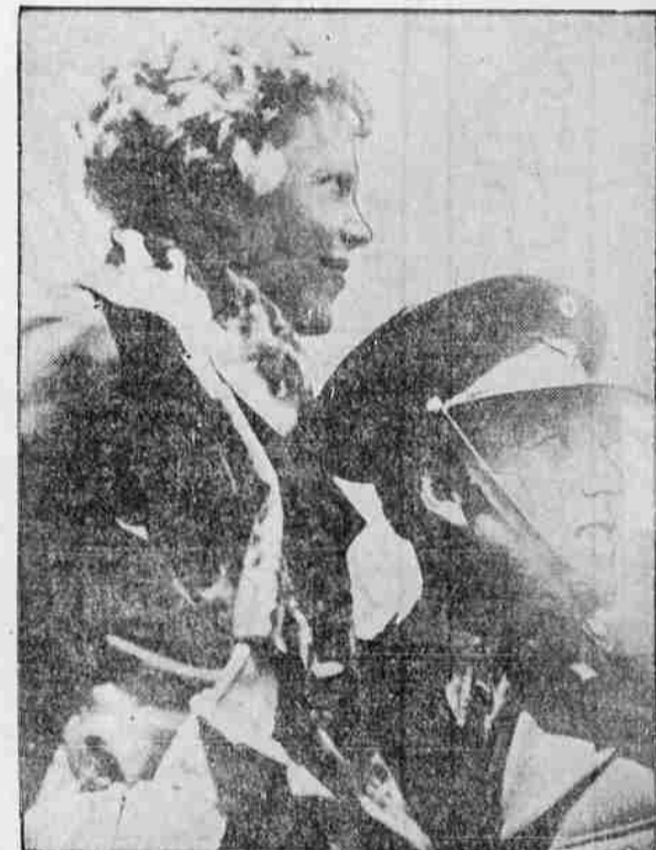
Amelia Earhart Putnam's plane for a non-stop flight from Burbank, Cal., to Mexico, D. F., were deflected 60 miles short of her goal when an insect flew into her eye and forced her to land. This shows her on her arrival in the Mexican capital.