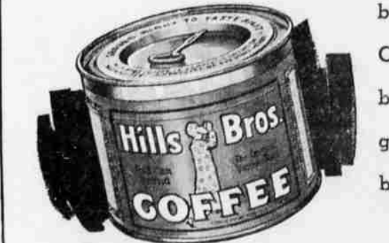
Copyright 1935 Hills Bros.