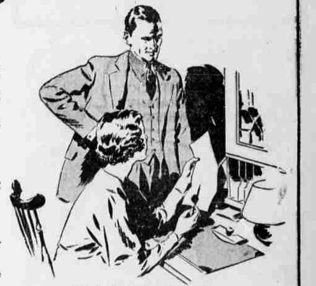
I don't think I've forgotten anything