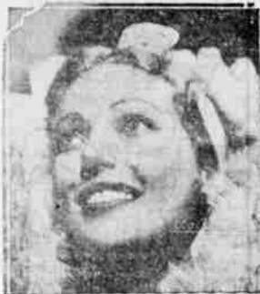
Loretta Young heads the cast of "Caravan," the musical story of the Hungarian wine harvest, playing today and tomorrow at the Roxy.