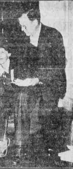
Wearing a happy smile, Amelia Earhart Putnam in her New York hotel room as she enjoyed a sandwich and glass of milk before going to sleep after her record breaking flight from Mexico City to Newark.