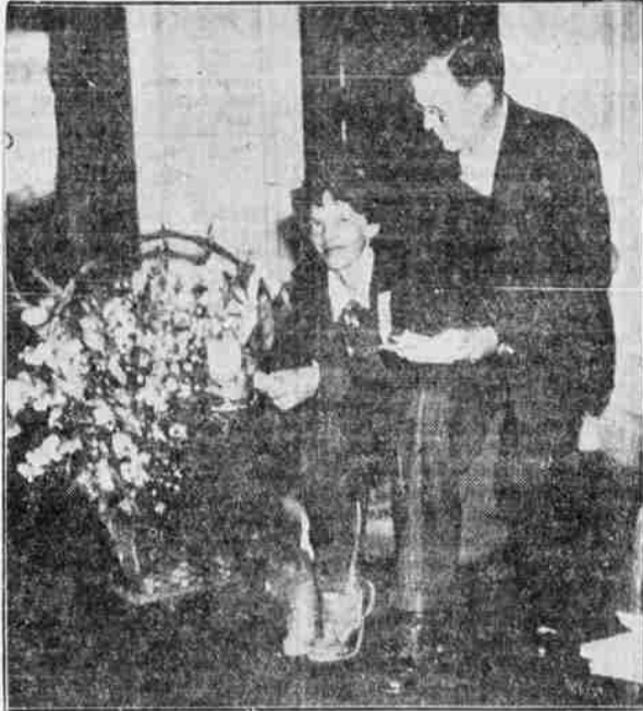
Wearing a happy smile, Amelia Earhart Putnam in her New York hotel room as she enjoyed a sandwich and glass of milk before going to sleep after her record breaking flight from Mexico City to Newark.