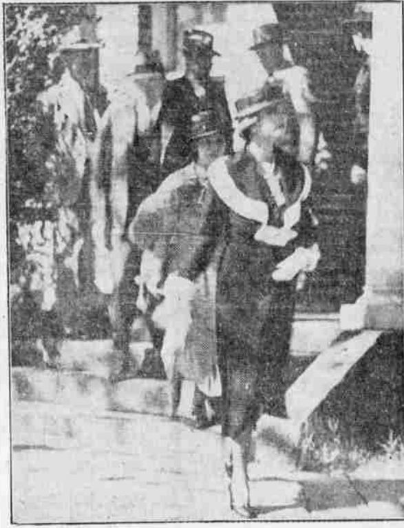
In a trial that lasted just ten minutes, Barbara Hutton Mdivani divorced her polo playing husband, Prince Alexis Mdivani, at Reno, Nevada. She is shown leaving the sheriff's office for the back door of the court house to get the decree. She refused to pose.