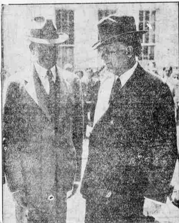
Senator McNary (left) of Oregon and Senator Borah of Idaho, both Republicans, and opponents of NRA, are pictured leaving the White House after a conference with President Roosevelt.