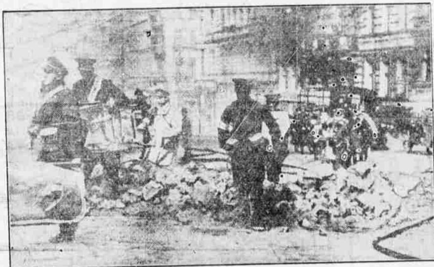
This Associated Press picture, taken in Berlin as airplanes attacked the city in maneuvers, was rushed to London and then radioed to New York. The air force was demonstrating its offensive attack following the abandonment of the Versailles treaty by Germany. The Red Cross is shown in action with "wreckage" in the middle ground.