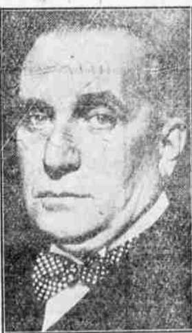
Vittorio Cerrutti (above), Italian ambassador to Germany, delivered to the German foreign office Italy's note objecting to German rearmament. It met a curt reception.