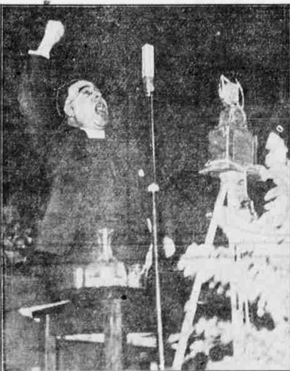
The Rev. Fr. Charles E. Coughlin, organizer of the National Union for Social Justice, calling for an united front at the first state mass meeting of the new organization in Detroit. Several members of congress also spoke at the mass meeting.