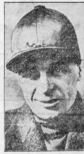
Jockey Gerry Wilson (above), the jockey up on Golden Miller when Miss Dorothy Paget's heavily favored steeplechaser fell in the Grand National race at Aintree, England, fell from the same mount on the following day. His fall in the big race created comment among London sports writers.