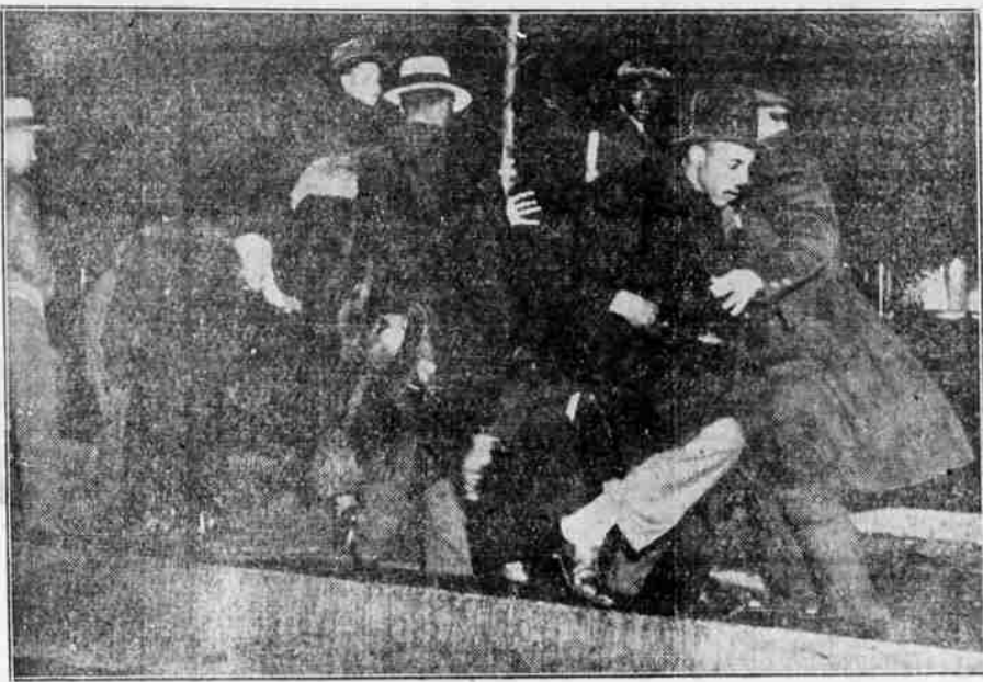
Police fighting the rush of crowds who assaulted pedestrians and looted stores in a riot in New York's Harlem. There were scores injured in the melee as 250 policemen tried to disperse the crowd. The riot started after a negro boy was said to have been ejected from a store.