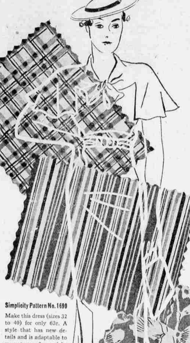
Simplicity Pattern No. 1690 Make this dress (sizes 32 to 40) for only 62c. A style that has new details and is adaptable to many types of materials.

Everybody Uses Cotton... and Wards Use Over 80,000,000 Pounds Yearly!