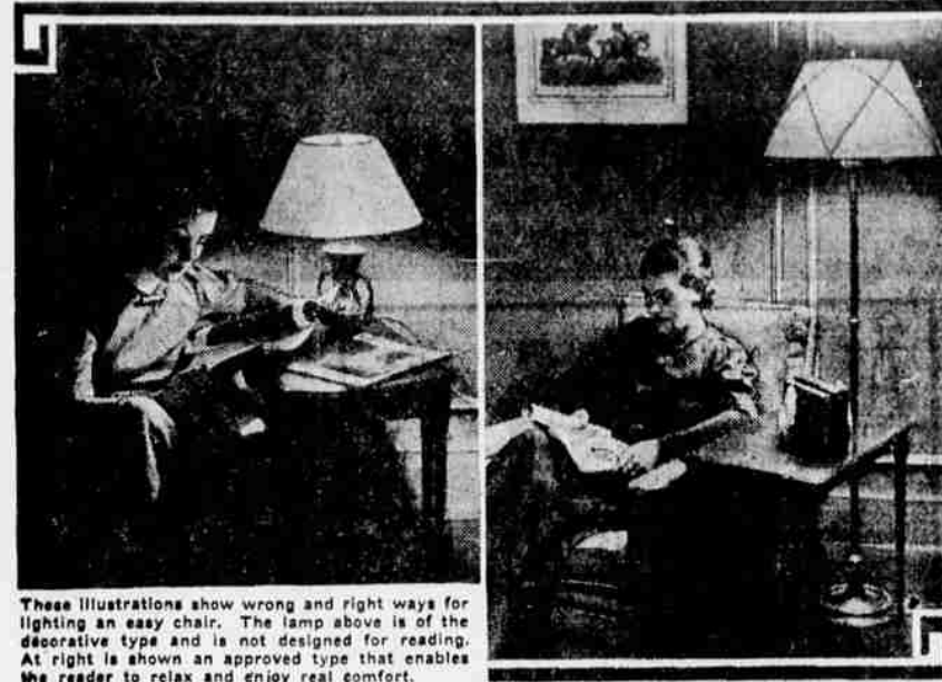
These illustrations show wrong and right ways for lighting an easy chair. The lamp above is of the decorative type and is not designed for reading. At right is shown an approved type that enables the reader to relax and enjoy real comfort.