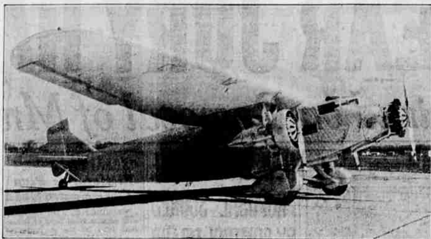
This tri-motor Ford plane will be at the Medford airport today and Wednesday, flying afternoons and nights. It is one of the largest ships to visit the city.