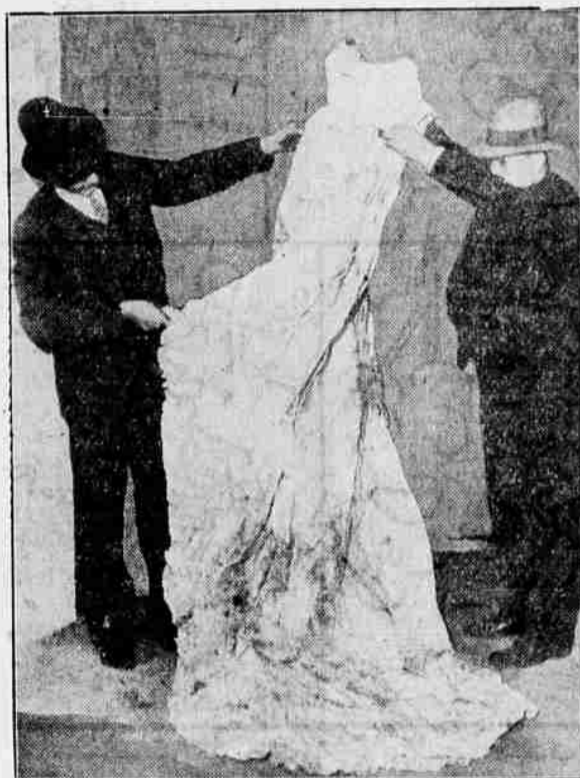
Colorado officials are displaying the $7000 wedding gown found in the meager possessions of "Baby Doe" Tabor, one-time mistress of millions, after her death in a hovel on the Matchless mine property near Leadville. Seventeen trunks, containing the dress and a valuable collection of silver, were found after the widow of Senator "Silver Dollar" Tabor had been found frozen to death in her bare cabin.