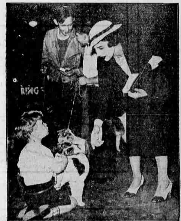
Helen Wills Moody, former world's champion tennis player, took time from her practice for a comeback on the courts to judge entrants in the children's class at a San Francisco dog show.