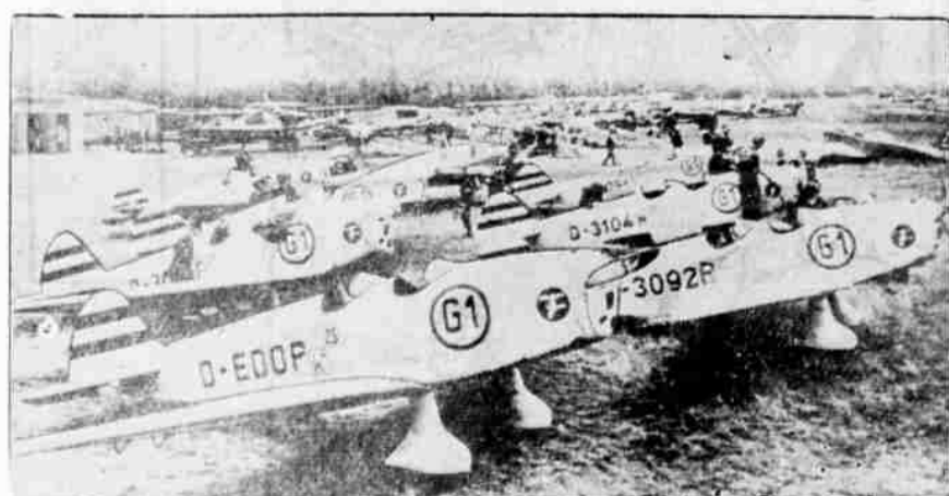
Planes of this type were among those taking part in air maneuvers over Berlin as Germany announced its intention to rearm. Smokepots and cannon-cracker bombs gave a realistic imitation of an enemy air raid in the spectacular attack.