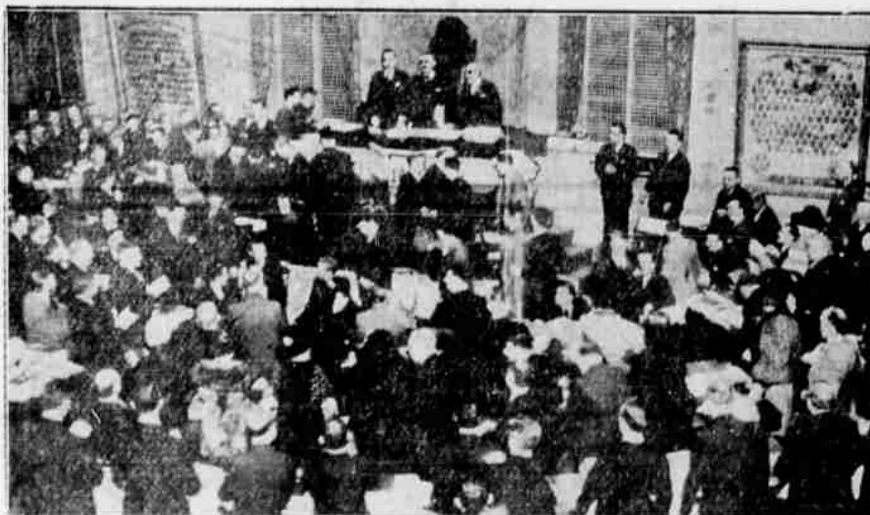
Gov. Martin L. Davey of Ohio addressing a special joint session of the legislature in Columbus after Harry L. Hopkins, federal relief administrator had taken over relief administration in the state. Davey later filed a criminal libel action against Hopkins and the Ohio senate voted to investigate the state relief situation.