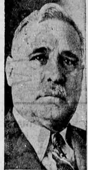
Cuba added to the wave of international turbulence as bombs burst in Havana and a strike gained headway in opposition to the government of Pres. Carlos Mendieta (above).