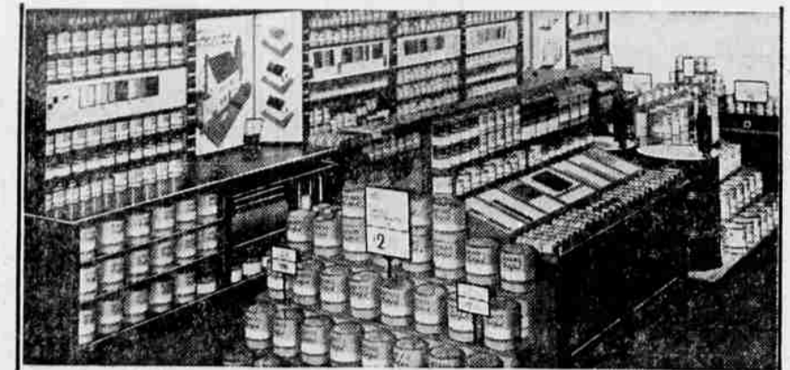
Here is a glimpse of the attractive new paint department just completed at Montgomery Ward's Medford store. The attractive panels which form a portion of the background for this effective paint display offer prospective purchasers interior and exterior color suggestions and charts that tell exactly how much paint is needed. Ward's varnish comparison tests and the "checkerboard" house paint tests are being featured in this smart, new Ward department.

of our business to our inventories is better than it has been for a long time. The operations of the National Housing Act, are, no doubt, largely responsible for this condition." Founder's Log Cabin Burned NEW PHILADELPHIA, O. (UP)—The three-room log house built by John Kinsley, founder of this city, was destroyed by fire here recently, caused by an explosion of an oil lamp. The cabin was built in 1803.