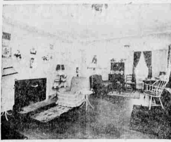
Modernization of this charming living room strikes a happy combination of period decoration and modern atmosphere. The interior illustrates the possibilities of modernizing a room of simple detail. While not shown in this project, many similar rooms may easily include such additions to living-room comfort as built-in bookcases, cabinets, window boxes, and like improvements. Much enjoyment is to be had in such airy and spacious rooms.

The modern, American living room literally lives up to its name. There is probably no other room in the home more frequently occupied by all members of the family. With the advent of the twentieth century the days of the parlor were numbered. The era of bric-a-brac, highboys crammed with the clutter of years, horsehair monstrosities, plush-bound long horns, whatnots loaded to the guards with china statuary, sea shells, and the countless other trinkets that made the parlor of another day an abomination—all have vanished. In their place we find the modern, carefully planned living room. The rococo has been supplanted in simplicity, bright color, spaciousness. As each year passes, the living room becomes more and more a room to live in.