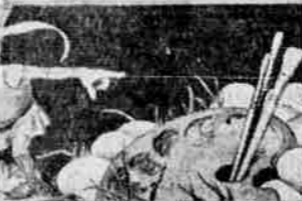
who had saved the world from the clutches of the Ice King, ruler of the Winter months.

This pagan festival of long ago has been converted by Christians today into one of the most popular occasions on their calendar. The fires, ceremonies and songs, and even the festival cakes of the ancients, survive today in hot-cross buns and sunrise services attended by thousands on mountain tops.