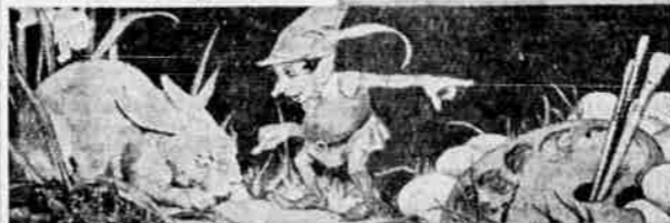
Right, White House egg rolling. Above, Easter telegram heading by Norman Rockwell. Left, Mt. Davidson sunrise service with giant cross.

The Easter egg comes down to us from ancient history centuries before the first annual egg rolling on the lawn of the White House, the ancients exchanged eggs with