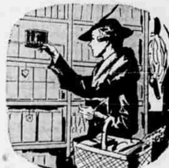
"Stick to Hills Bros. Coffee"

another all you want, provided you stop coffee-floating. There's not one of these brands you've been getting that has a leg to stand on, no matter how you