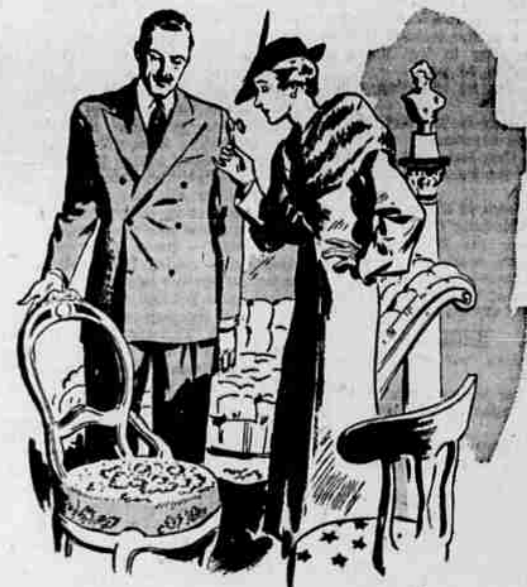
His wife's enthusiasm for antique furniture