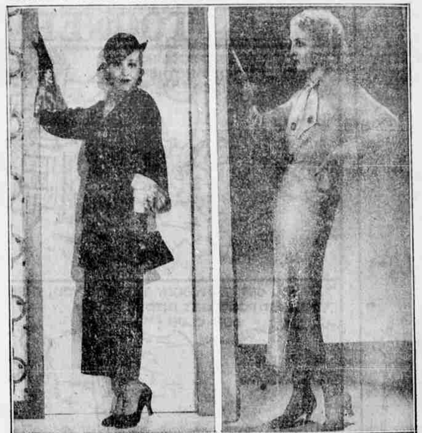
These two gowns will be chic for early spring wear. At left is stunning informal afternoon costume, with a knee-length tunic top of gold-checked black mora cam crossed down the center front with gold lacings, through gold rings. Features are an ascot and deep-draped cuffs of dull gold paillettes. Right is a two-piece ensemble for office wear of wool material, smart with a cutaway jacket of peplum effect.