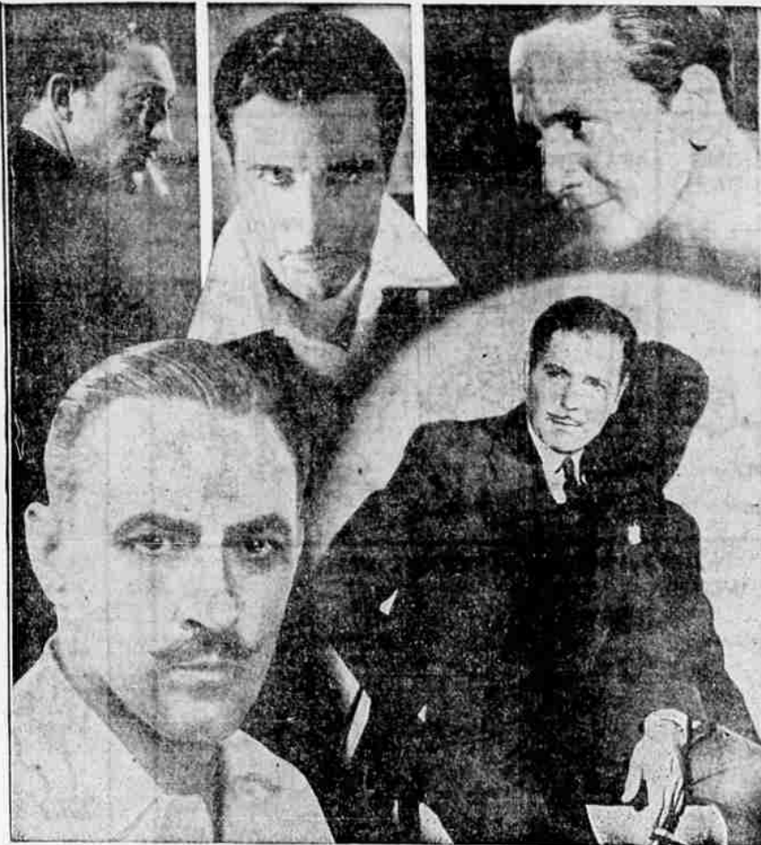
The matinee idol is with us again. Not that he ever really left us, but he is in particular demand in Hollywood at the moment. The gentlemen of the classic profiles have crowded out the males of more rugged countenance and the current demand is for screen heroes like Warren William (top, left), John Barrymore (bottom, left), John Boles (top, center), Frederic March (top, right), and Warner Baxter (bottom, right).