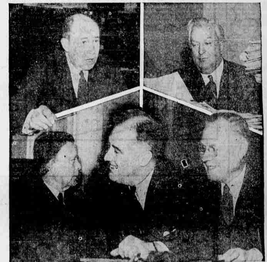
President Roosevelt (center) turned his back on the first half of his term of office and faced the third year at the nation's helm with stubborn resistance to his program staring him in the face. Labor, represented by William Green (lower, right), president of the A. F. of L., resents the President's support of Donald Richberg (upper, left), NRA boss. Senate leaders are blocking his legislative program, with Sen. Pat McCarran (upper, right), Nevada Democrat, holding up the work relief bill and Sen. William E. Borah (lower, left), famous Utah Republican warhorse, openly attacking the new deal consistently.