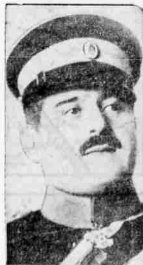
General Pera Zivkovich (above), minister of war of Yugoslavia, may emerge as the strong man of his country, according to recent dispatches. Rumors intimated that a group of cabinet members may seize control of the government.