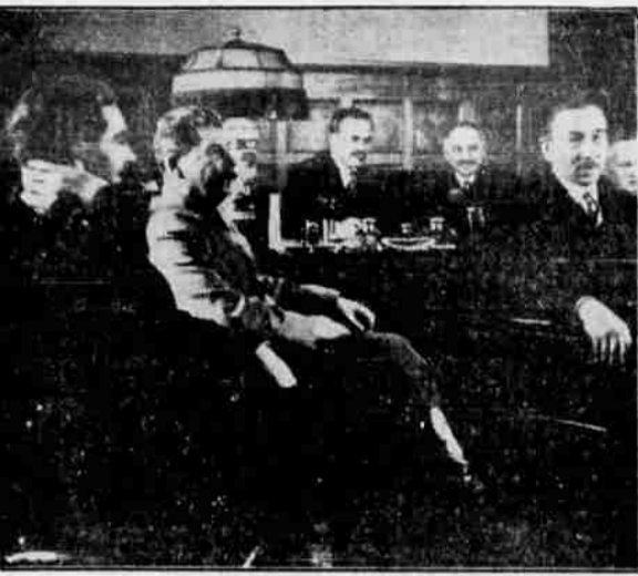
Capt. Anthony Eden, Great Britain's young diplomat, is shown during his recent conference with I. V. Stalin of Russia on means of maintaining peace in Europe. They are shown in the study of V. M. Molotov in the Kremlin in Moscow. Left to right: Eden, Stalin, Molotov, I. Maiski, Soviet ambassador to Great Britain; Lord Chilton, British ambassador to Moscow and Maxim Litvinov, Soviet commissar for foreign affairs.