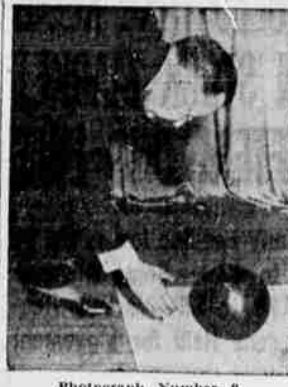
Photograph Number 8.

8—Keep back of foul line in practice and bowl better in leagues and tournaments.