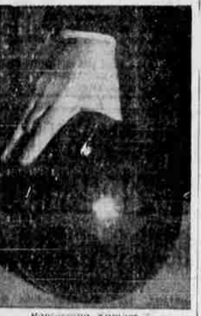
Photograph Number 7.

10—If you have the right kind of a ball, correct position, and a free, easy delivery—PRACTICE. But practice will not make you perfect; there are no perfect bowlers. The many combinations, the apparently good hits that do not secure results, the uncertainty, makes bowling the fascinating game it is. However, you can, with sufficient practice, compete with and often defeat the so-called stars.