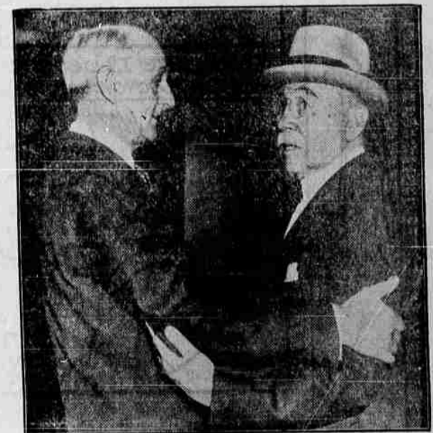
Senator McAdoo (left), Democrat of California, and Senator Keyes, Republican from New Hampshire, shown holding a most informal conference in the hallway as they attended a meeting of the senate finance committee.