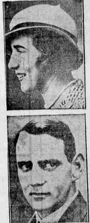
Despite denials from the Danish royal family, rumors persisted that Princess Ingrid of Sweden (above) would be married soon to Crown Prince Frederik of Denmark (lower).