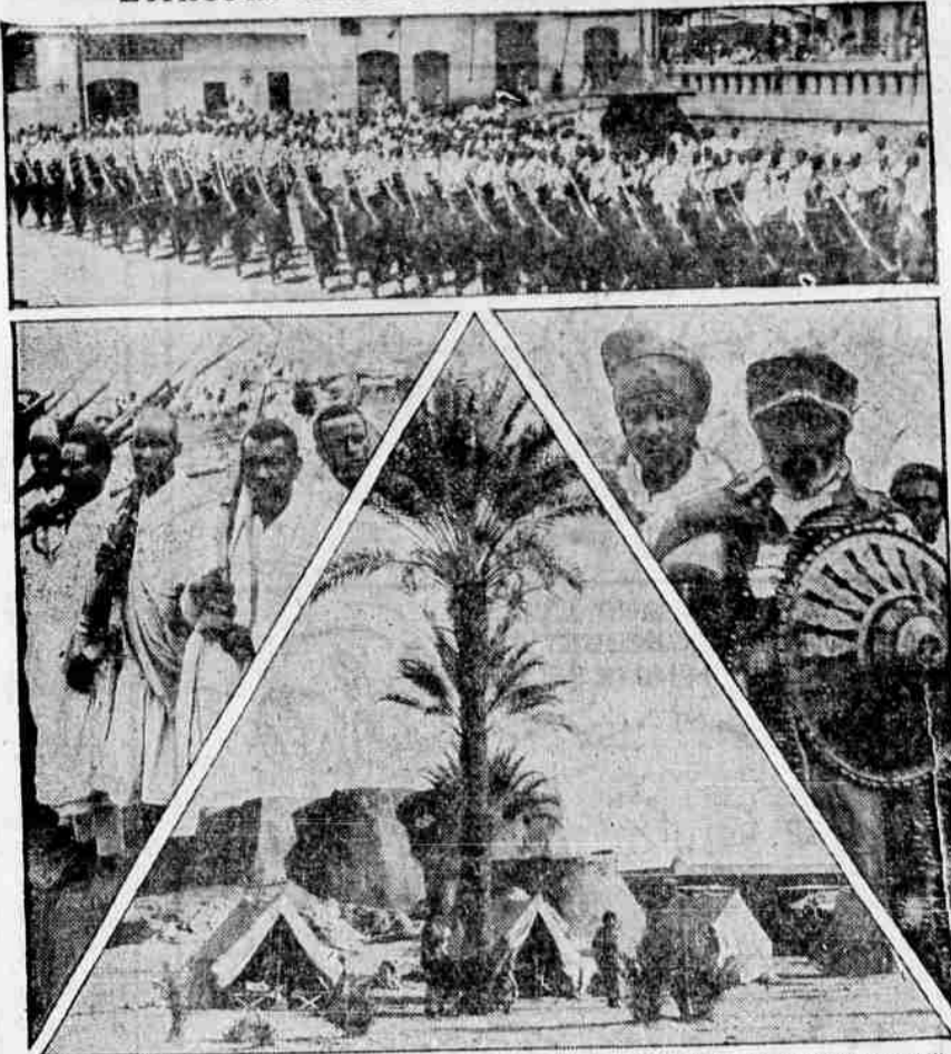
Informed through an official communique from Premier Mussolini that Italy stands ready to mobilize even to 8,000,000 men, Ethiopia prepares to face Italian troops in the event of a war in East Africa. Above are shown Ethiopian troops in full dress parade during a recent review by Emperor Haile Selassie. Left are typical warriors in their native garb and right is a tribal lord. Below is one of the chain of Italian forts on the Italian Somaliland-Ethiopian border.