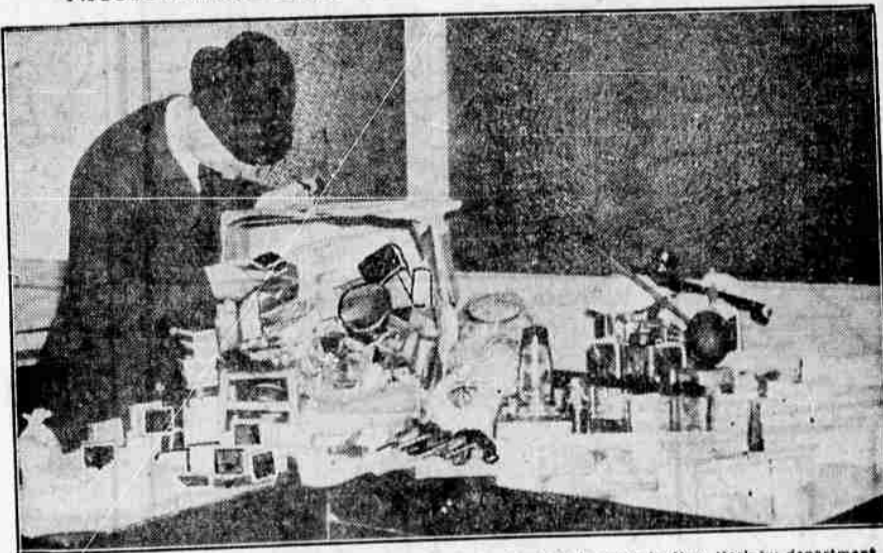
This assortment of narcotics was part of the contraband seized in raids in New York by department of justice agents as part of a nationwide drive that resulted in nearly 2000 arrests throughout the country in one day.