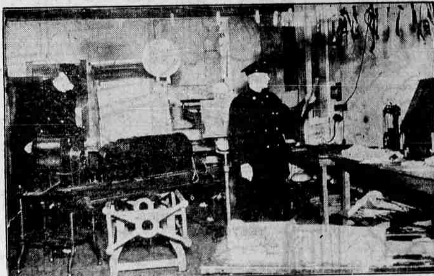
United States officers inspect a Detroit, Mich., printing plant which they allege was headquarters of a $150,000 counterfeiting ring. They found more than $37,000 in bogus money in this "secret room."