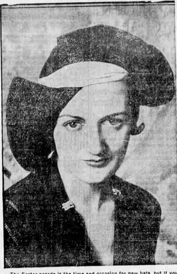
The Easter parade is the time and occasion for new hats, but if you had one like this—well, you might not walt. It's in shiny black straw, set off by a pale blue peau d'angle ribbon, (Associated Press Photo)