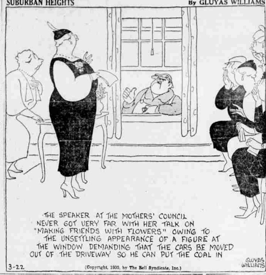
THE SPEAKER AT THE MOTHERS' COUNCIL NEVER GOT VERY FAR WITH HER TALK ON "MAKING FRIENDS WITH FLOWERS" OWING TO THE UNSETTLING APPEARANCE OF A FIGURE AT THE WINDOW DEMANDING THAT THE CARS BE MOVED OUT OF THE DRIVEWAY SO HE CAN PUT THE COAL IN

WASHINGTON, March 22.—(AP)—Secretary Morgenthau said today the government is prepared to sell gold to foreign countries that can offer an attractive proposition. Recent sales to the Bank of Mexico and to Guatemala, he said, had cleared the way to similar negotiations with other countries.