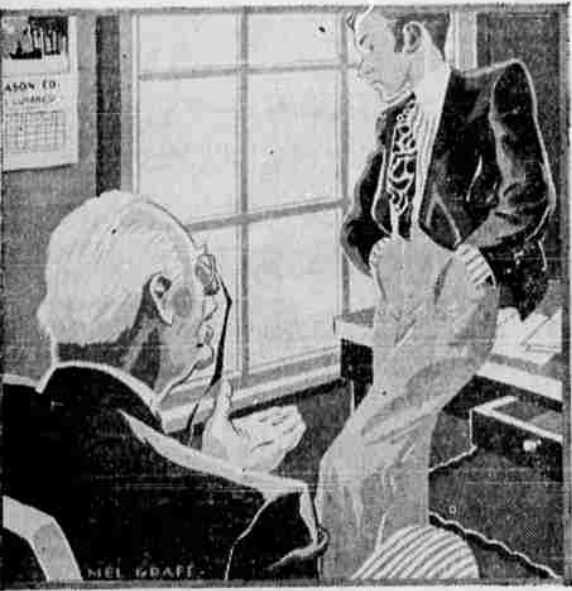
"Out with it," commanded the Judge.

JAMES snatched the violets and fled from the house. Terry, his cocker spaniel, came bounding after him. But Terry had howled and howled the nights his grandparents had died. He did not want Terry howling in the cemetery and tearing his heart.