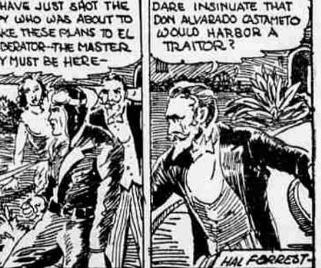
(Copyright, 1935, by The Bell Syndicate, Inc.) 3-16