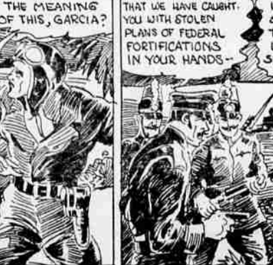
(Copyright, 1935, by The Bell Syndicate, Inc.) 3-16