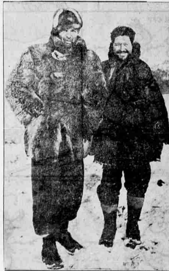
While being heralded as the pace setter for men's fashions, Clark Gable (left), movie star, was going around like this working on his newest film at Mt. Baker, Wash. His "brother bum" on the right is Jack Oakie.