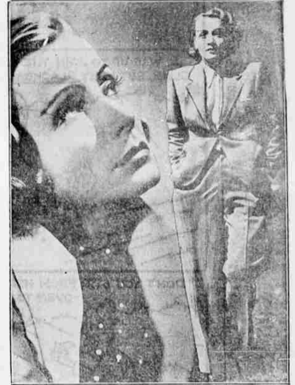
Rivalry between two of Hollywood's glamorous stars, Greta Garbo (left) and Marlene Dietrich approached a possible climax with the Swedish actress' recent public appearance after her consistent aloofness. Observers suggested Garbo may be inspired by the public attention her rival has attracted by adopting male garb. Interchanges of directors and leading men have added complication to this Hollywood real-life drama.