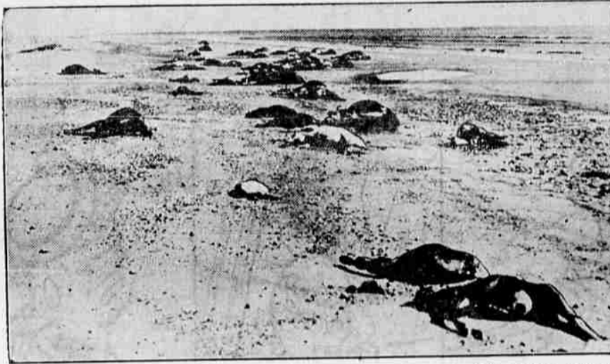
Cattle, valued at $1,000,000, were killed during a severe cold spell along the Gulf of Mexico. Some of the 25,000 to 30,000 head are shown strewn along the unprotected beaches.