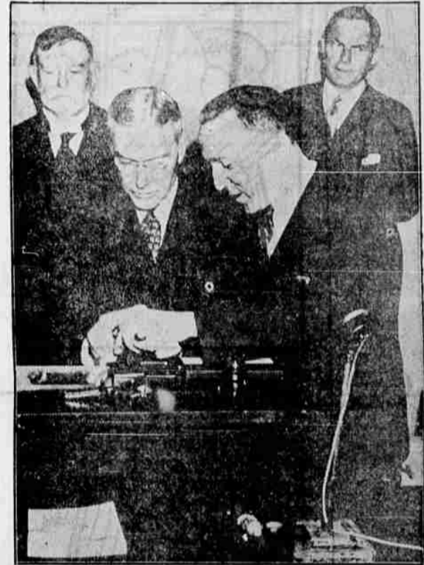
John D. Rockefeller, Jr., (shown in center) was one of several prominent men who were fingerprinted for identification purposes in New York under the supervision of J. Edgar Hoover, head of the federal bureau of identification.