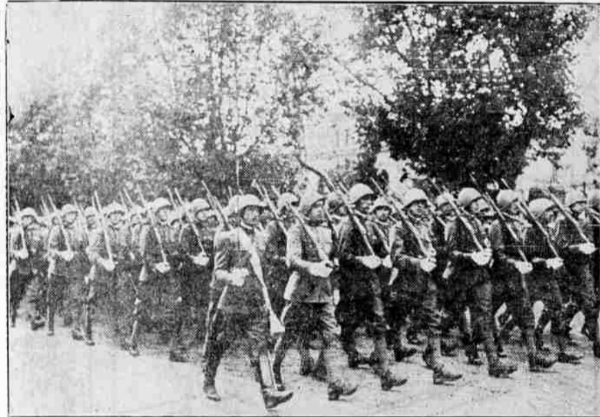
Italian troops similar to these pictured here were among those mobilized by Mussolini as the African situation became intense. Italy may send thousands of soldiers to Italian Somaliland because of recent clashes with Ethiopian regiments. The mobilization of two divisions and recall of the class of 1911 was announced by Mussolini.