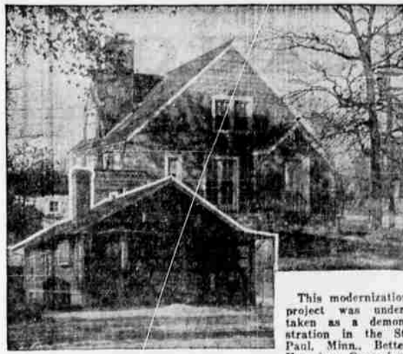
but it reveals how an unattractive cottage (below) can be transformed into a charming dwelling (above).