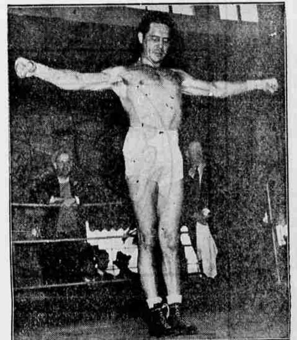
Max Baer, lothario of the ring as well as heavyweight champion, was bored when another cameraman asked him to pose. So he stretched, closing his eyes at the same time.