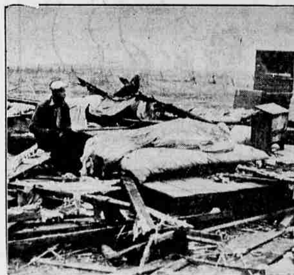
This negro is shown sitting in the wreckage of the house from which he escaped when a tornado struck near Grapeland, Tex., killing ten, injuring approximately 67 other persons and wrecking 31 houses.