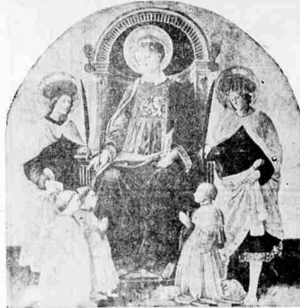
"St. Lawrence Enthroned" (above), by Fra Filippo Lippi, was one of two masterpieces sold by J. P. Morgan to the Metropolitan Museum of Art in New York. The other was Rubens' "Anne of Austria."