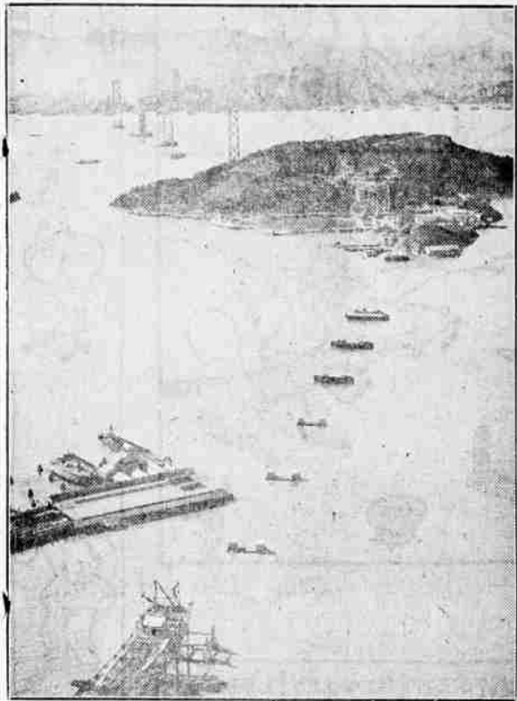
An aerial view of the traveler derrick erecting a span (lower left) of the San Francisco Oakland bay bridge. Pier foundations and piers for the entire structure can be seen in this photo.