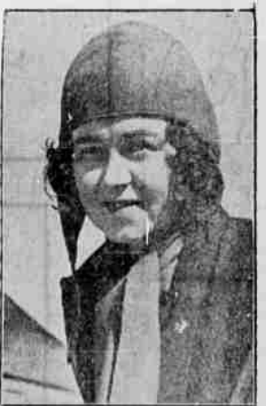
Reported planning for some spectacular venture, Laura Ingalls (above), noted aviatrix, has passed her test for "blind flying." She was pictured in Los Angeles, where she was to take delivery on a new plane.