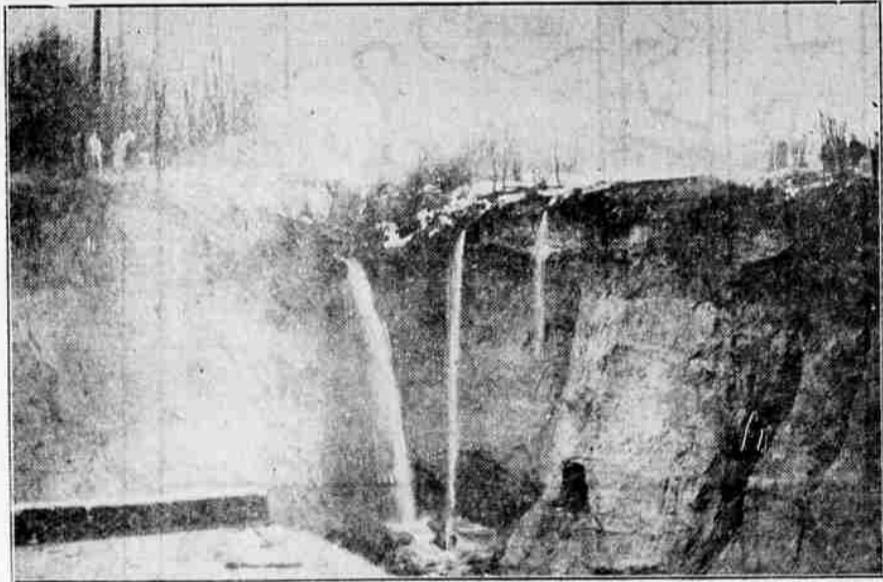
A chasm 50-feet deep was cut in the marine drive at Vancouver, B. C., when a swollen creek washed through it after a severe snowstorm, followed by a warm spell and rain. Some of the damage is shown.