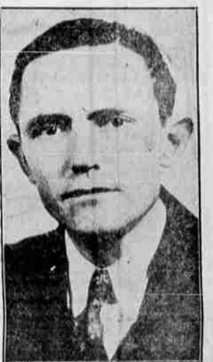
Rep. Leo E. Nyberg (above) tentatively proposed in the Arkansas legislature to offer the state to the national administration as a laboratory for new experiments in the New Deal.