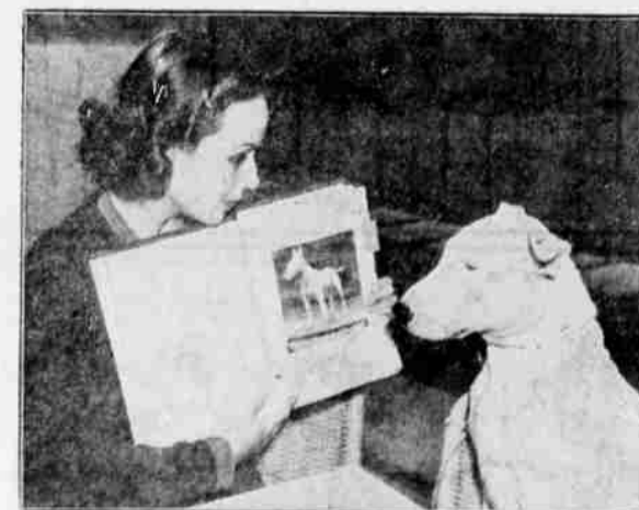
Dolores Del Rio, Hollywood film star, shows "Mike," her pet bull terrier, his future mate. The photograph is of "Bonnie," another bull terrier, which is coming from Boston to be "Mike's" bride.