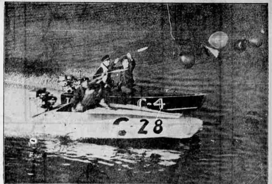
Southern California speedboat enthusiasts have taken to a new sport known as "balloon bustin'" to amuse the crowds. Here the Rising Sun, fast Japanese craft, and Johnny Weismuller's speedy Tarzan are steeple contest.