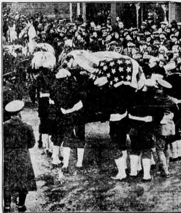
The body of Admiral Robert E. Coontz, former commander of the United States Navy, was laid to rest in a Hannibal, Mo., cemetery overlooking the Mississippi river. He died in Bremerton, Wash.