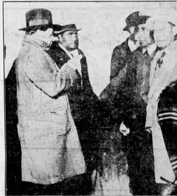
Several of the 13 men arrested for alleged participation in a widespread military plot being interviewed in the Mexico, D. F., jail. The Mexican government charges American money financed the plot.