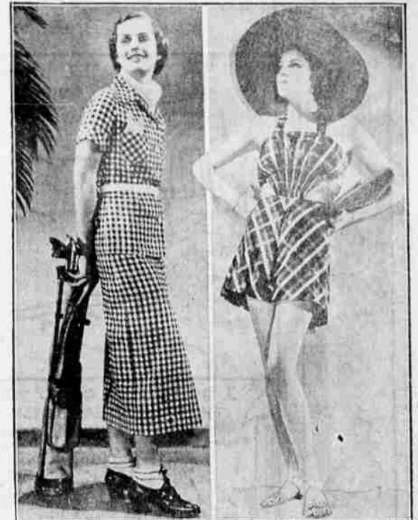
The attractive bathing suit shown on the right is of red and black silk plaid taffeta with a bandeau effect. The new silk mode for golfing wear on the left is a two-piece sports frock modeled in a brown and white check material light enough for warm weather, suitable for the smartest links.