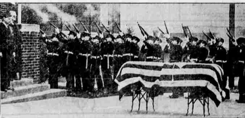
A volley from the guns of a squad of marines marked the final tribute of the Puget Sound navy yard in Bremerton, Wash., to the former commandant, Admiral Robert E. Coontz, retired. Admiral Coontz died after several heart attacks.