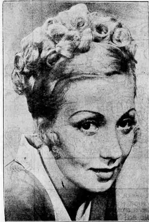
The latest in the way of coiffures is shown by Ann Sothern, blond film actress, whose tousled curls are piled high above a straight band of hair across the forehead. The ear ornament is a shooting star effect with sprays of diamonds.