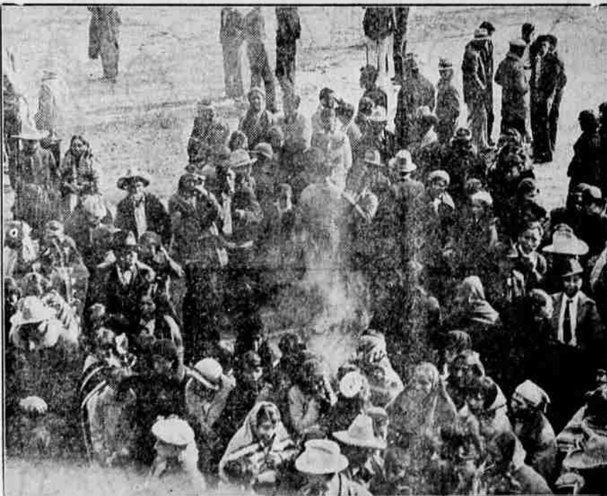
More than 2000 Indians from New Mexico pueblos and reservations were at Santa Fe to attend a barbecue at which thousands of pounds of buffalo were served with the trimmings. Some of the Indians are shown standing around a blazing fire awaiting food.