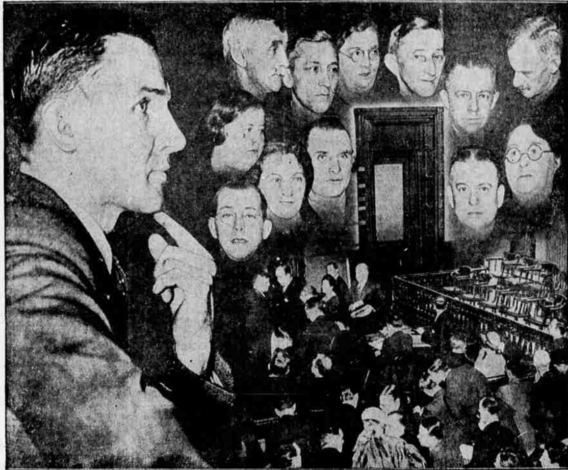
The evidence is in—the jury is out—and Bruno Richard Hauptmann, still stolid and inscrutable, awaits the answer to his fate in his trial at Flemington, N. J., for the Lindbergh kidnap-murder. He, and the world, have eyes glued to that door in Husterdon courthouse, waiting the moment when the twelve men and women of the jury will solemnly file back into the room and take their places in the jury box. He, and the world, wait for the voice of the jury foreman which will echo around the globe—"Your honor, we find the defendant..."