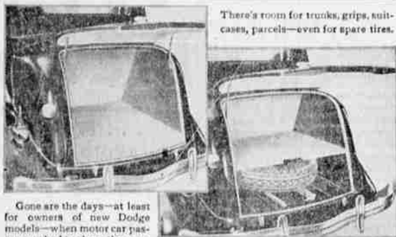
There's room for trunks, grips, suitcases, parcels—even for spare tires.

Gone are the days—at least for owners of new Dodge models—when motor car passengers had to share the comforts of the tonneau with grips, suitcases and other travel appurtenances. It is different now. Not only luggage, but the spare wheel and tire are carried in the rear, in the space which, when closed, looks like a trunk and affords room for more things than a motoring trunk ever held before.