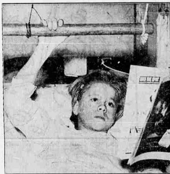
Mickey Rooney, motion picture boy star of "Midsummer's Night Dream" who played the part of Puck, fractured his leg while snow-sledding at Big Pine, Cal. He's shown making the best of things in a hospital bed.