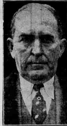
Representative William B. Bankhead of Alabama was selected for Democratic floor leader as representatives and senators assembled for the 1935 session of congress.