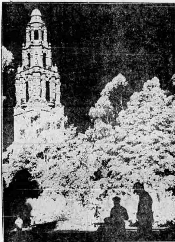
This striking photograph of one of the buildings of the California-Pacific international exposition which will open in San Diego late in May was made on an infra-red plate, giving the appearance of snow.