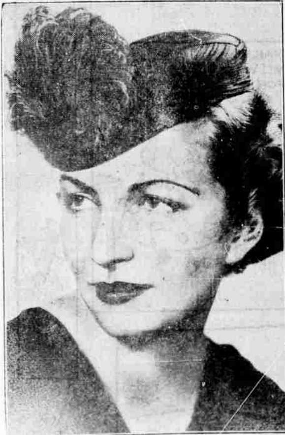
One of the latest creations for twilight and evening wear in smart circles is this youthful appearing "page boy" turban, designed by Lilly Dachs. It is featured in glass taffeta.