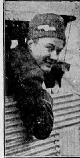
Miss Helen Richey, first woman to hold a regular job as co-pilot for a commercial airline carrying mail and passengers, is shown as she prepared to take off from Washington, D. C.