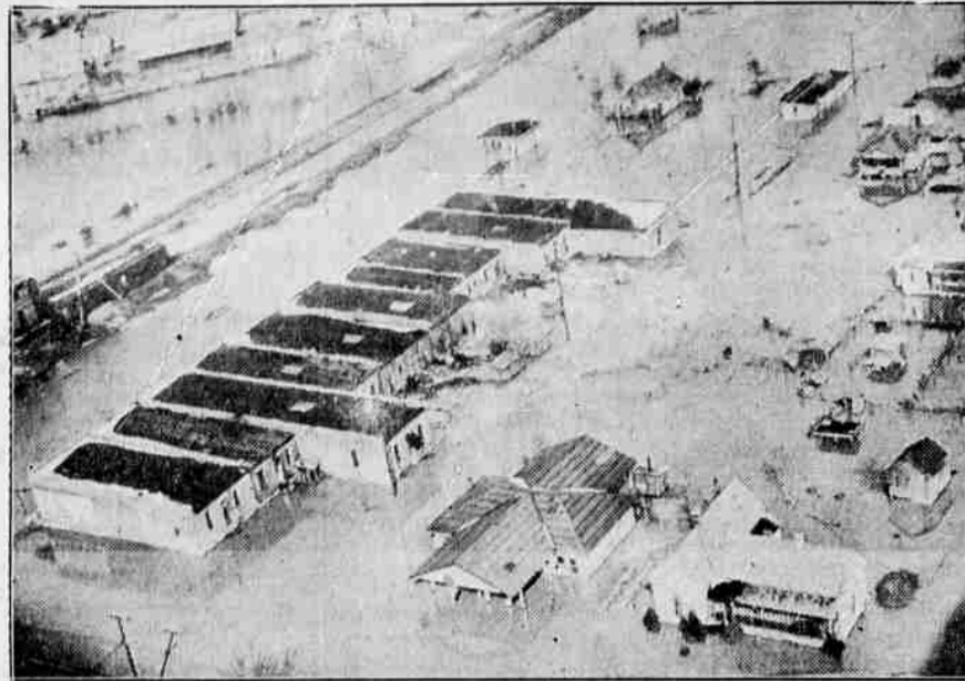
A picture of Darling, Miss., under water after the Coldwater river left its course and ran through the town. Five negroes lost their lives in the flood.