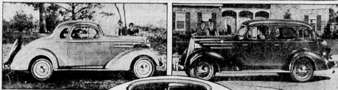
The Coupe model typifies the beauty and style of Chevrolet's New Master De Luxe series for 1935. Improved performance and exceptional economy also characterize these cars.