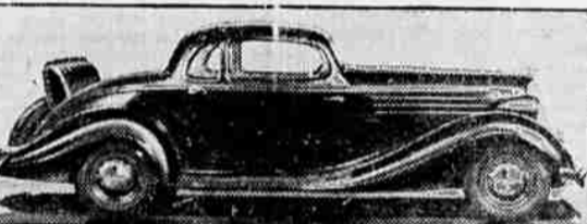
Terraplane Six Coupe mounted on 112-inch wheelbase with an 88-horsepower engine. This car is made either as a three-passenger model with baggage compartment in the rear or as a five-passenger model with rumble seat.

Typical of Chevrolet's two new lines of cars are the models illustrated here. The Master De Luxe series reveals strong emphasis on beauty and style. Mechanically, the Master De Luxe series and the New Standard series have much in common, including the Master engine, in which numerous refinements have been made to enhance performance, durability and economy. As these pictures reveal, the New Master De Luxe departs distinctly from previous Chevrolets in the striking advance which has been made in body design and trim.