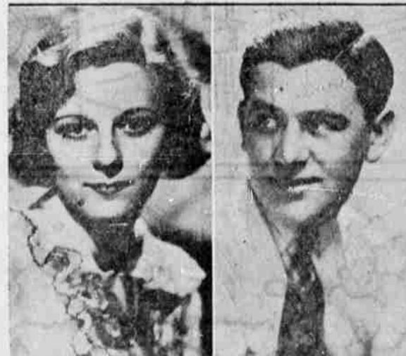
Filmland was surprised by the Yuma, Ariz., elopement of Margaret Sullivan, screen actress, and William Wyler, a director, who were married after an acquaintance of only eight weeks. They returned to Hollywood after the ceremonies by a plane.