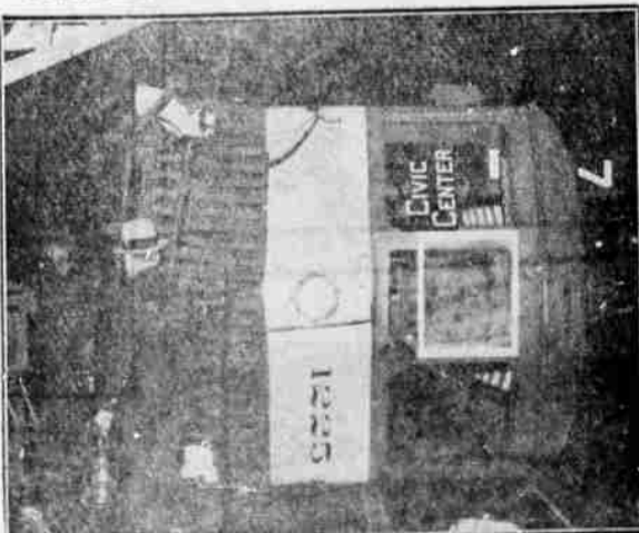
Attacks on street cars were continued in Los Angeles as car men remained on strike. This car was stopped by about 75 men who requested the passengers to get off and then overturned it near the downtown section.