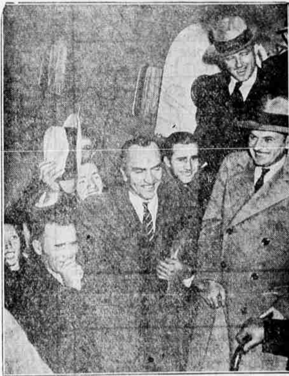
Capt. Eddie Rickenbacker, noted wartime flying ace, is shown doffing his hat to admirers as he landed at Newark, N. J., after spanning the continent in 12 hours, three minutes and 50 seconds—a new speed record for transport planes. The big twin-motored plane averaged 221 miles an hour from Los Angeles, with a single stop at Kansas City for refueling.