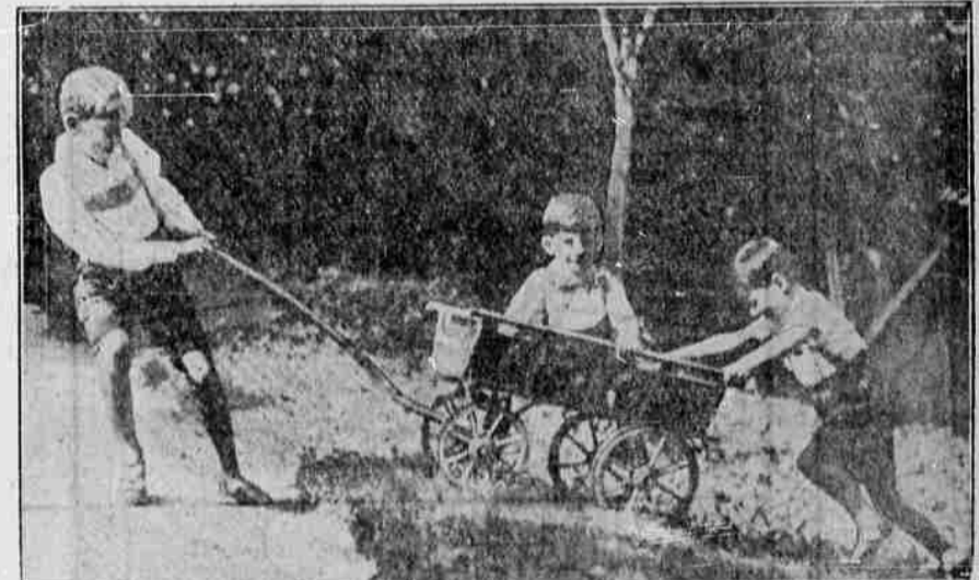
This remarkably informal picture shows Europe's youngest monarch, 11-year-old King Peter (left) of Yugoslavia, playing with his two younger brothers, Prince Andrei (center) and Prince Tomislav, in the garden of the royal palace outside Belgrade.