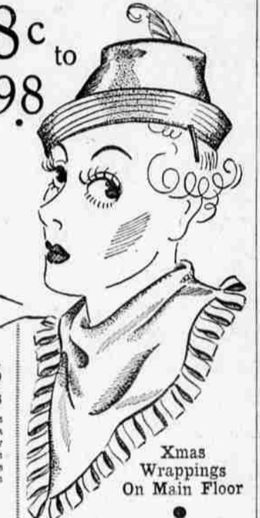
Xmas Wrappings On Main Floor