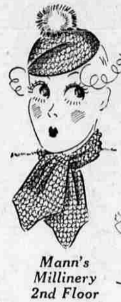
Mann's Millinery 2nd Floor