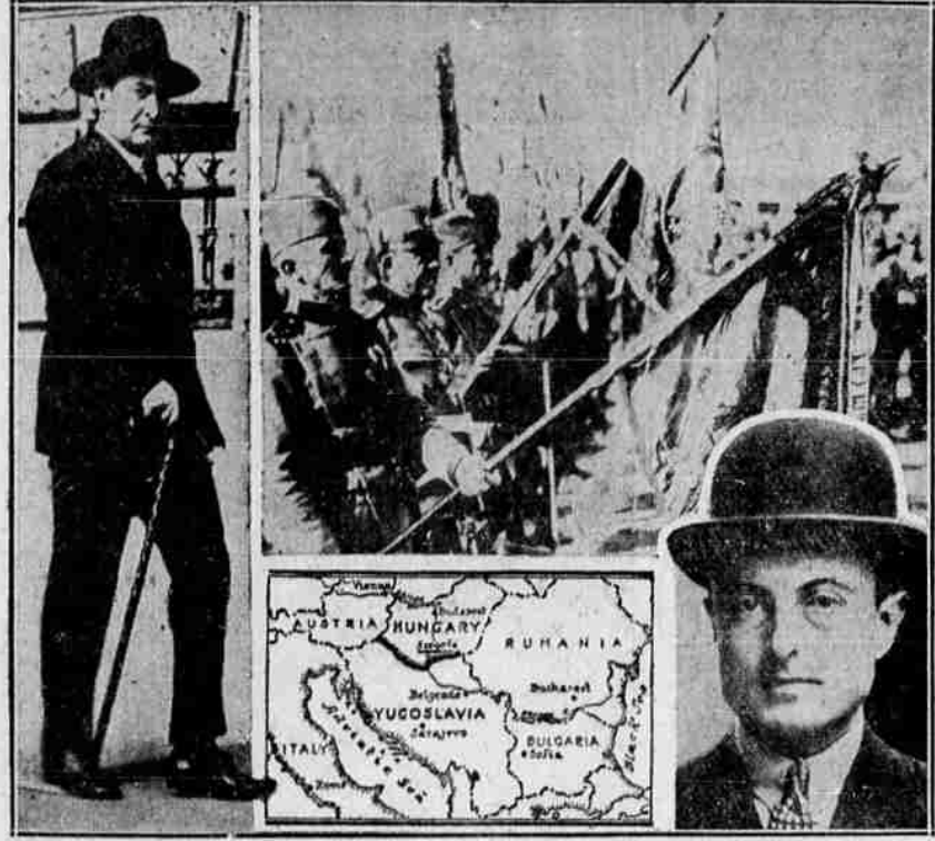
Expulsion of 27,000 Hungarians living within her border by Yugoslavia, after subjecting them to hard-ahips has strained relationships between Hungary and Yugoslavia to a point where armed conflict is immi-nent, with the Slavs mobilizing troops (above) on the Hungarian border. The heavy line on the map shows the border line with Szeged (underlined) the threatened center. Premier Goemboes (left) of Hungary is trying to avert an open break with forces under Prince Paul (lower right), regent until King Peter be-comes of age.