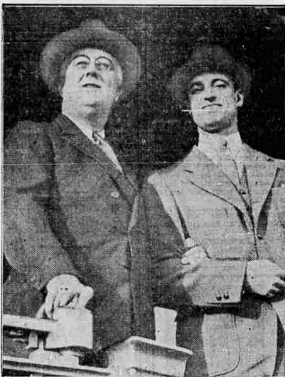
After three weeks of study and play at his home in Warm Springs, Ga., President Roosevelt (left) is shown with his son, James, on the rear of his train as he departed for Washington. While at Warm Springs the President worked out a program he plans to submit to the new congress to put the new deal on a permanent basis.

to the hospitals on that day and it brightens homes which otherwise would have to count their Christmas as part of the war's sacrifice. A share in all this is one of the things membership in the Auxiliary gives. For the children of World War veterans the Auxiliary is also doing a very important work. It is adding thousands of children every year to receive the necessities of life. Destitute children are placed in homes where they can receive their rightful heritage of a wholesome American upbringing. Assistance is given to widows of veterans and wives of disabled men in keeping their families together. Nurseries for the children of the disabled are sponsored at government hospitals. Wherever children