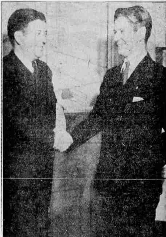
On the basis of incomplete returns it appeared that Wisconsin's voters had elected Robert LaFollette, Jr. (left), to the United States senate and had named his brother Philip (right) governor by a narrow margin. The LaFollette brothers, both of whom ran on the progressive ticket for offices they previously had held, are shown extending mutual congratulations.