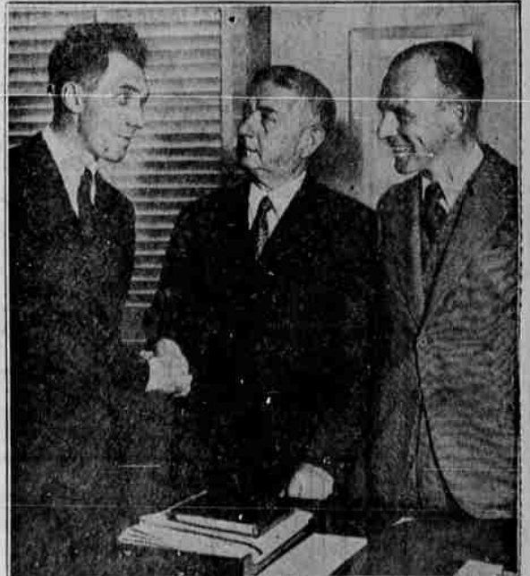
Here are the three men chosen to guide the destinies of the National league after their election by club owners in New York. Left to right: Ford Frick, 39-year-old former newspaperman who becomes president of the league; John Heydler, who resigned the presidency and was named chairman of the board, and Harvey Traband, former secretary to Heydler, who becomes the league's secretary and treasurer.