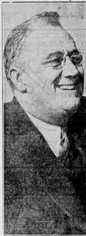
In what was considered a significant extemporaneous speech at Tupelo, Miss., President Roosevelt declared that the experiment for cheap power and human rehabilitation in the Tennessee valley "is going to be copied in every state in the union before we get through." The chief executive is shown as he spoke in Tupelo, the first community to buy power from the TVA. At left is an excellent closeup study of the President in gay mood for his Thanksgiving holiday.