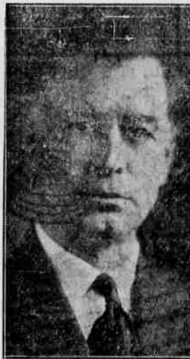
Key Pittman, president pro tem of the U. S. senate and chairman of the foreign relations committee, was reelected senator from Nevada on the democratic ticket.