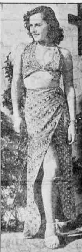
Paulette Goddard, motion picture actress, whose name has been romantically linked with that of Charles Chaplin, wearing the slightly American version of the native costume of Tahiti at Palm Springs, Cal.