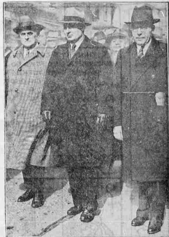
Among the 10,000 men and women attending funeral services for the five Kelayres, Pa., miners slain from ambush during an election-day parade were leaders of the democratic party in Pennsylvania. Shown here, left to right, as they prepared to march in the procession are Senator-Elect Joseph Guffey; Gov.-Elect George H. Earle, and David Lawrence, state democratic chairman.