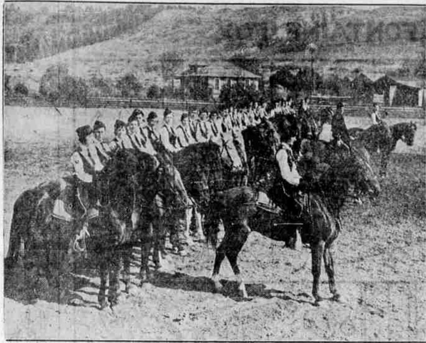
Ninety-five women of the Santa Monica, Cal., bay region have organized a feminine cavalry patrol known as the "Fourth Squadron" for possible duty in time of need.