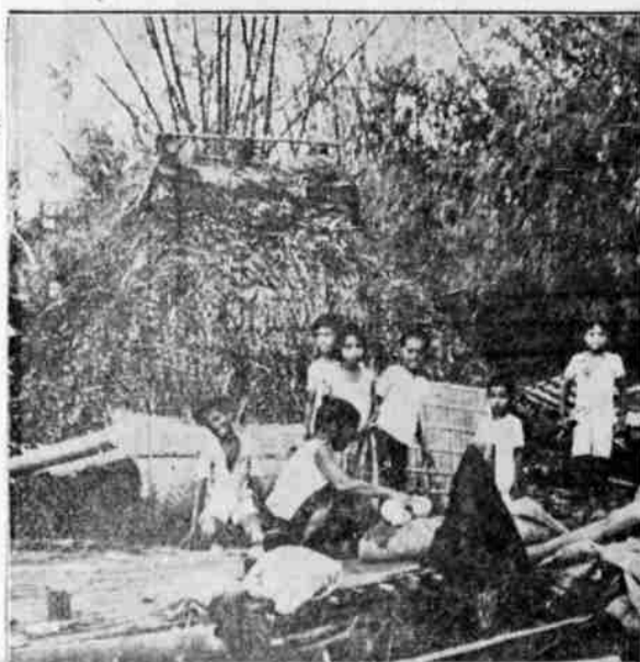
This is a typical scene of the plight thousands of Filipino families were in after a 97-mile typhoon struck Manila and central Luzon. The bamboo-thatched huts were toppled over and wrecked.