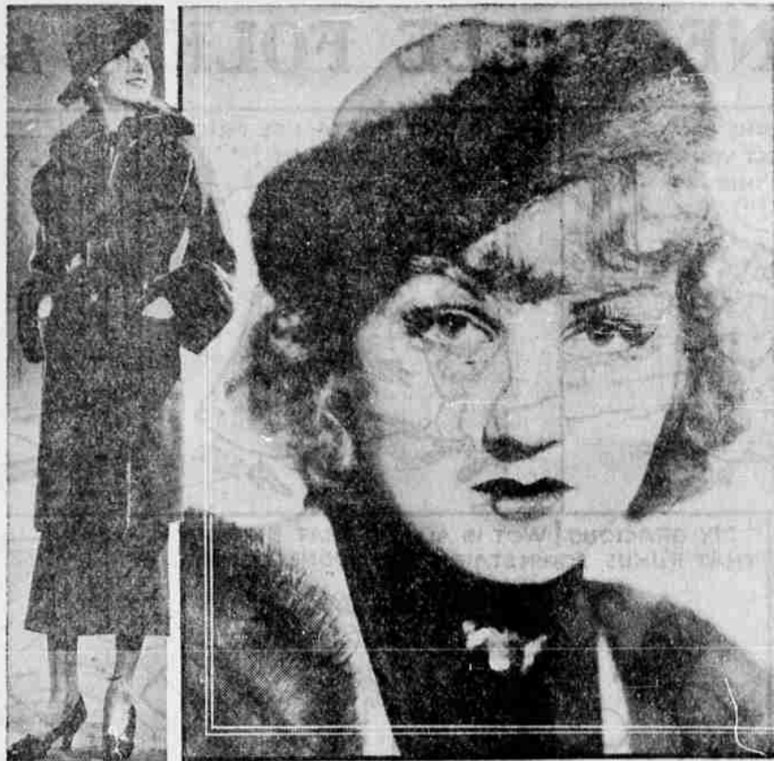
One of this fall's favorite versions of the smart suit is shown at left—a luxurious fall ensemble lavishly trimmed with beaver, the three-quarter length coat matching a brown wool dress. At right, Grace Bradley of the films wears a turban of beige wool, trimmed in sable, with more than a hint of Russia about it.