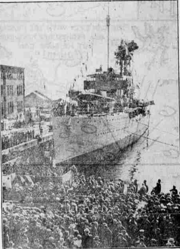
The latest word in small fighting ships, the U.S.S. Worden was launched from the Puget Sound, Wash., navy yard building dock amid traditional ceremonies. The newest destroyer of the navy is the third of the name to serve in the fleet. It is shown floating free after the scagates of the dock had been opened.