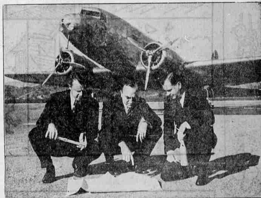
Taking off from the Burbank, Cal., airport, Capt. Eddie Rickenbacker started a one-stop flight to New York in an effort to establish a new coast-to-coast record for air transports. He hoped to break his own record of 13 hours and two minutes. Passengers were aboard.