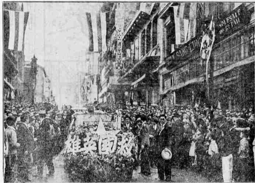
The party of General Toai Ting Kai, the man who held off the Japanese army during the siege of Shanghai, moving through the congested streets of San Francisco's Chinatown where he was greeted by 7,000 countrymen. It was the greatest reception ever accorded a visit to the quarters.