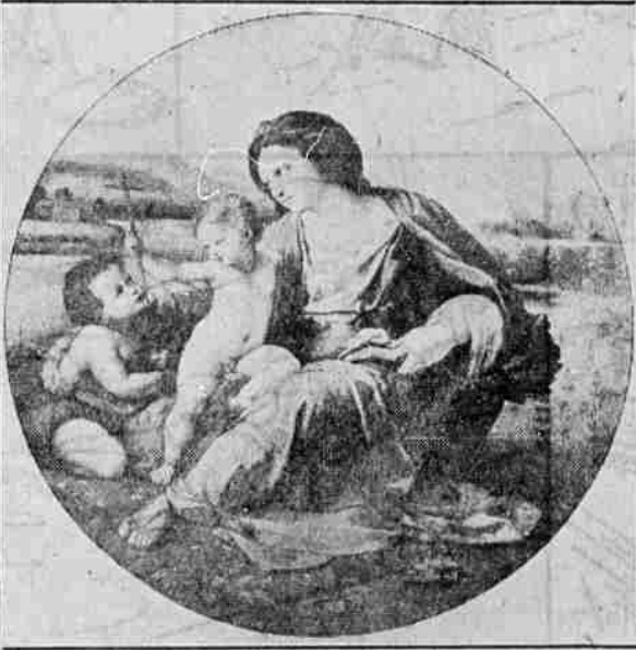
Dispatches to a Paris newspaper that Andrew Mellon had paid $1,500,000 to the Soviet government for Raphael's "Alba Madonna," a reproduction of which is shown above, brought denials from the Pittsburgh offices of the former secretary of the treasury. Mellon is vacationing in Scotland.