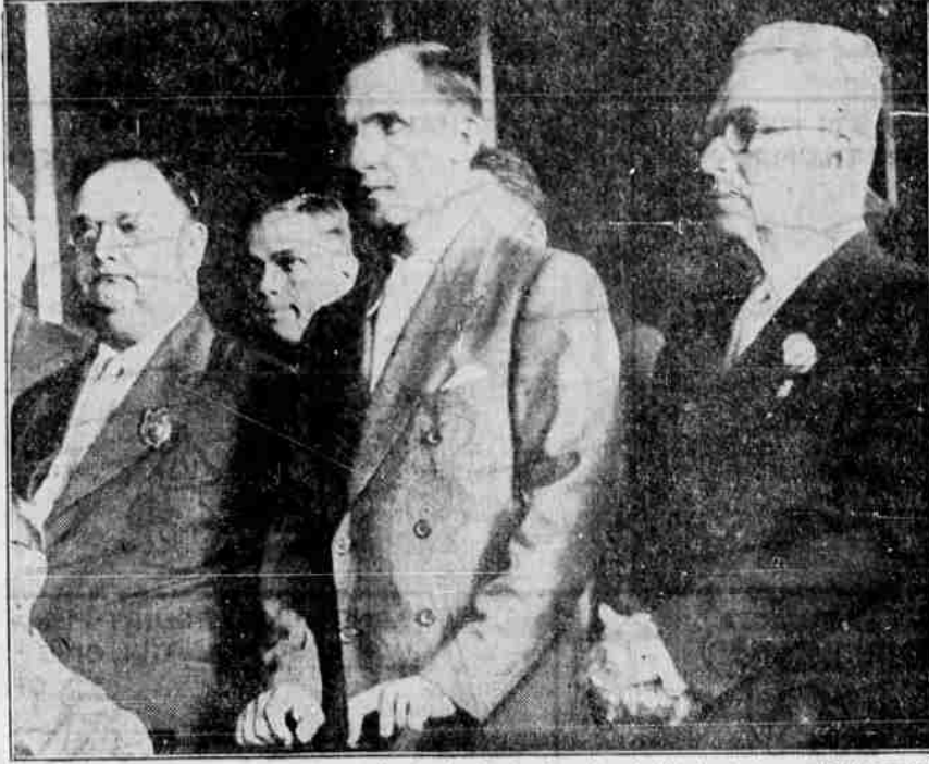
Bruno Richard Hauptmann, prison pallor beginning to show despite his fresh shave, slickly-combed hair and erect bearing, enjoyed a momentary and unappreciable technical freedom just after this picture was taken. It shows his arraignment in the Bronx courthouse when that county's charge against him of extortion was removed from the trial calendar to clear the way for his extradition to New Jersey to stand trial for murder in the Lindbergh case.