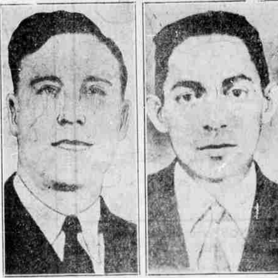
Two persons whose activities were closely checked in the widespread investigation of the Lindbergh baby kidnaping were Isadore Fisch (right), the man Bruno Hauptmann said left him the ransom money a year ago, and Henry Uhlig (left), a friend of Fisch. Fisch died of tuberculosis in Germany some months ago. It was established that he had paid his ocean passage with gold certificates, believed to have been part of the ransom bills.