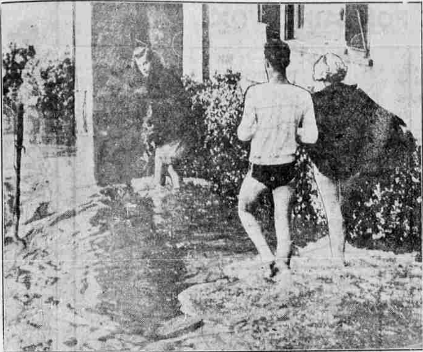
Bathing suits proved effective garb for residents in certain sections of Long Beach, Cal., when heavy rains caused floods which filled the streets. These pretty misses made sport of the storm.