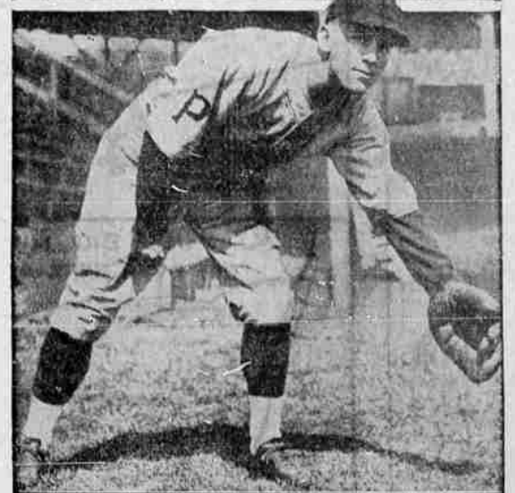
After the sudden collapse of the New York Giants in the National League pennant race two weeks before the end of the season, Bill Terry, Giants' boss, promised a housecleaning. He started proceedings by parting with three players and $75,000 cash for Dick Bartell (below), captain and shortstop of the Phillies. The players traded, shown above left to right, were George Watkins, outfielder; Johnny Vargoz, third baseman; and John "Blondy" Ryan, shortstop.