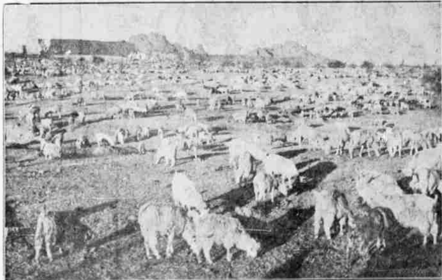
There were 30,000 sheep in this flock, rounded up by government buyers to be slaughtered for Phoenix, Ariz. The company was given a government contract to slaughter 500,000 head of sheep from the ranges of Arizona, New Mexico and Texas.