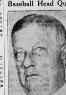
John Arnold Heydler, president of the national league since 1916 and connected with the circuit since 1903, resigned because of ill health. His resignation is to be effective December 1.