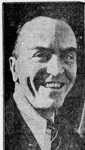
Capt. Eddie Rickenbacker.

NEWARK, N. J., Nov. 8.—(AP)—Captain Eddie Rickenbacker's prophetic of a new transcontinental speed record for transport planes has come true. After breakfasting in Los Angeles, the war ace with two co-pilots and three passengers flew into the Newark airport last night in his big twin motored (Douglas) Airliner.