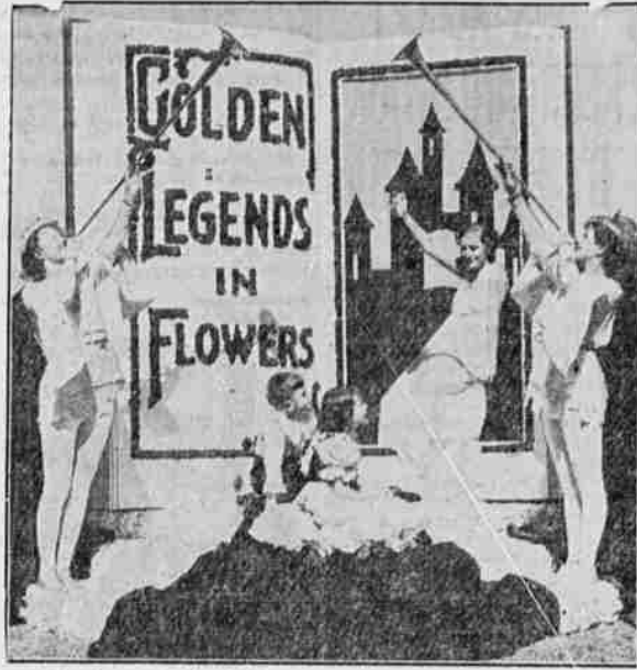
The theme for the 1935 tournament of roses at Pasadena New Year's Day was disclosed with the announcement the pagentry will be constructed to represent various story book tales. Heralded by pretty pages the open leaves of a large book framed a story teller who announces the famous legends.