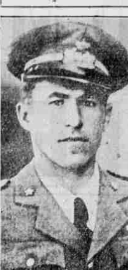
Lieut. Francesco Agello, "crazy boy" of Italian aviation, beat his own world record for speed when he piloted a seaplane 440,679 miles an hour at Desenzano, Italy.