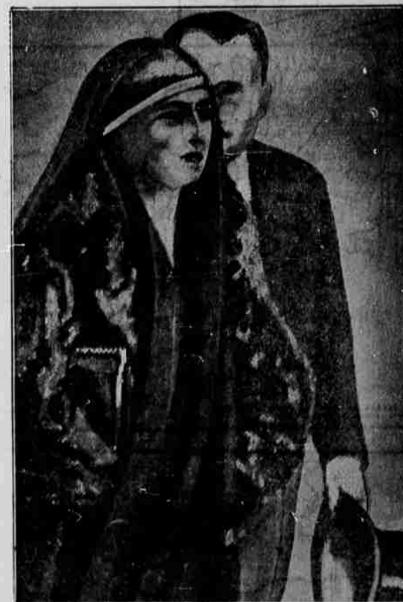
Queen Marie of Yugoslavia is shown after her arrival in Marseille, where her consort, King Alexander, was slain by an assassin. Later she joined her 11-year-old son, now King Peter II, in Paris for their return trip to Belgrade.