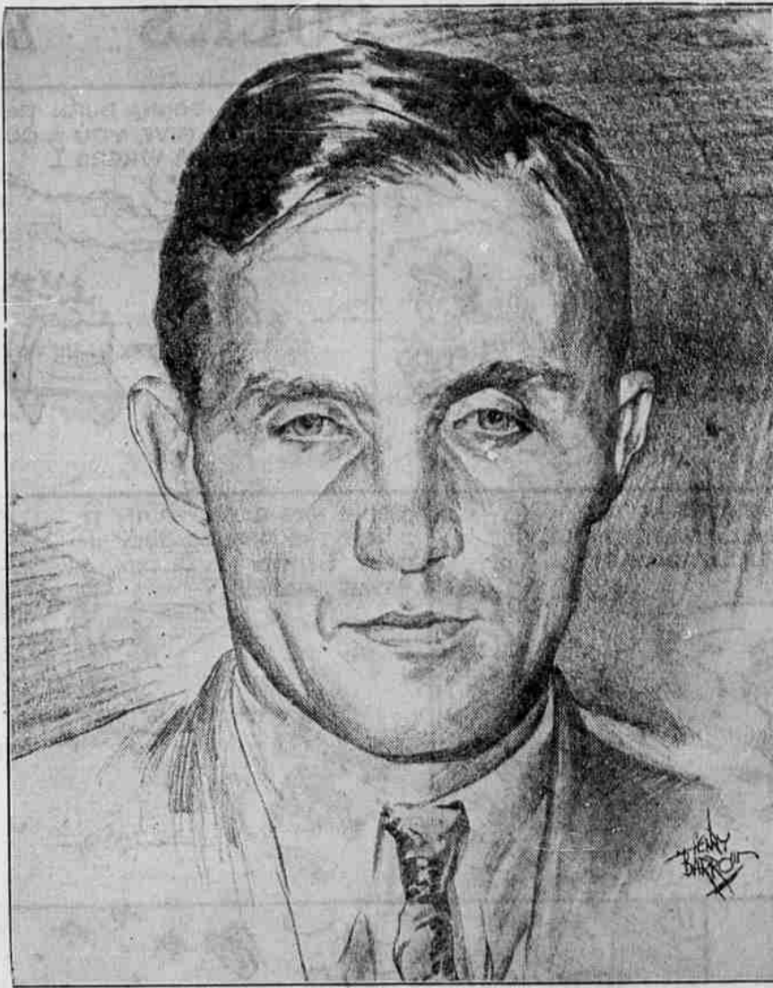
Above is a striking study by an Associated Press staff artist of Bruno Richard Hauptmann, arrested in connection with the Lindbergh kidnaping case and arraigned on charges of extortion.