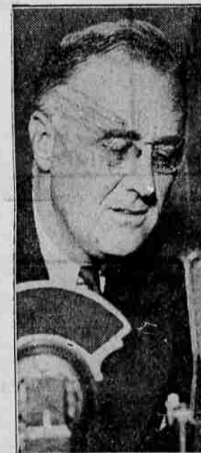
President Roosevelt is shown as he spoke to the nation from Washington in the "fireside chat" in which he said he would confer with capital and labor groups soon with a view to achieving a "trial period of industrial peace."