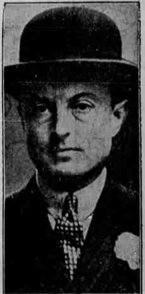
The will of the slain King Alexander of Yugoslavia named his cousin, Prince Paul (above), as one member of the three-man regency council to serve during the reign of the nation's new boy-king, Peter II.