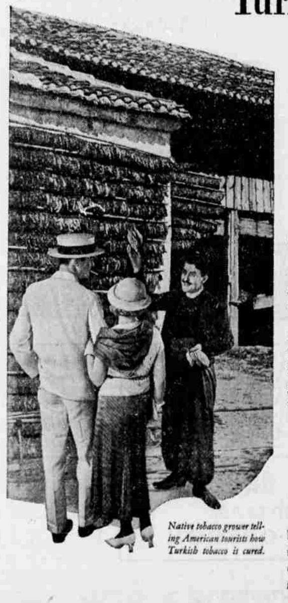
Native tobacco grower telling American tourists how Turkish tobacco is cured.

On the air— MONDAY WEDNESDAY SATURDAY ROSA NINO GRETE FONSELLE MARTINI STURCKGOLD KOSTELANETZ ORCHESTRA AND CHORUS 6 P. M. (P. T.)—COLUMBIA NETWORK