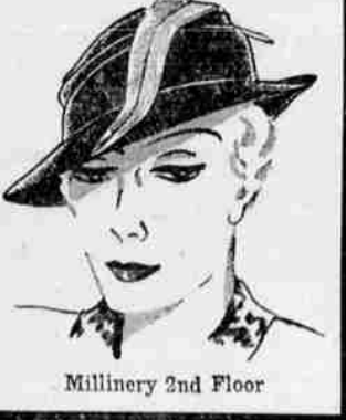
Millinery 2nd Floor

Boys' Wool Jersey SUITS In the Kiddies' Shop on the Main Floor a Sale of Small Boys' Wool Jersey Suits in Brown, Green and Navy Blue. These are in sizes 2 to 8 and made with a Zipper Fastener. $2.98 ea.